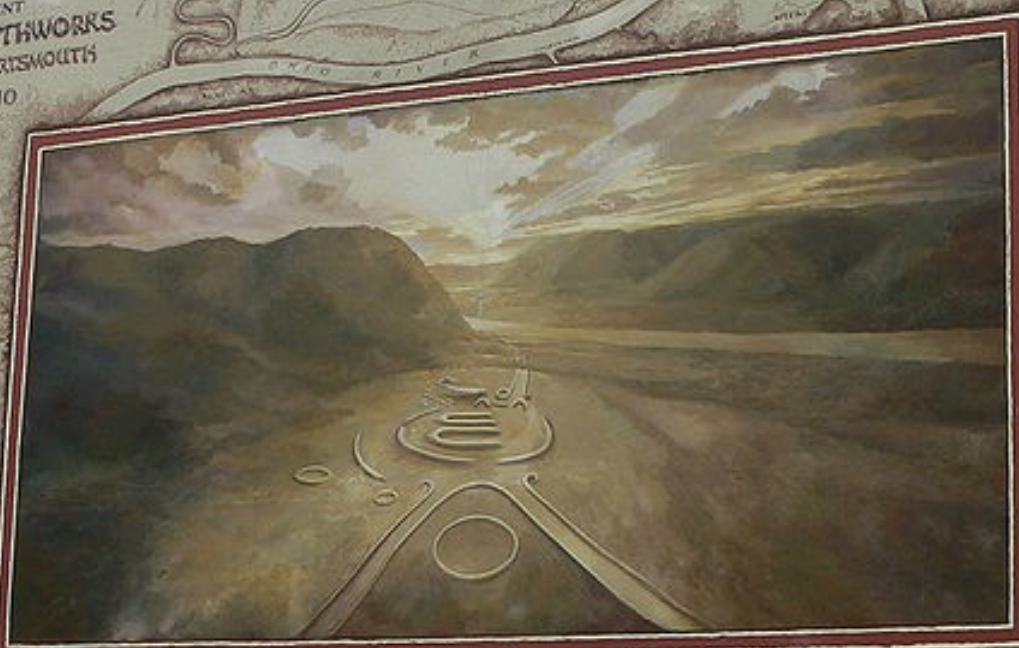
A VIEW OVER THE PORTSMOUTH AREA 2000 YEARS AGO

Looking over present day Greenlawn Country High School, Mound Park, New Britain, the Ohio River, and the Stearns Farm in Selicon, Kentucky