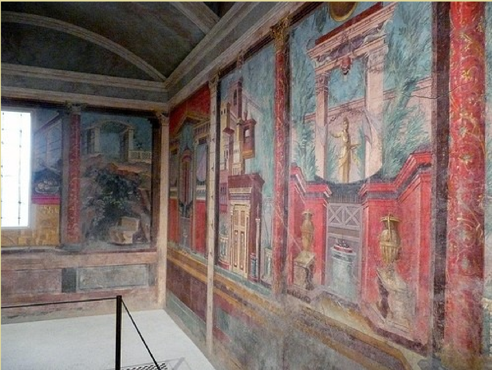
Roman bedroom wall