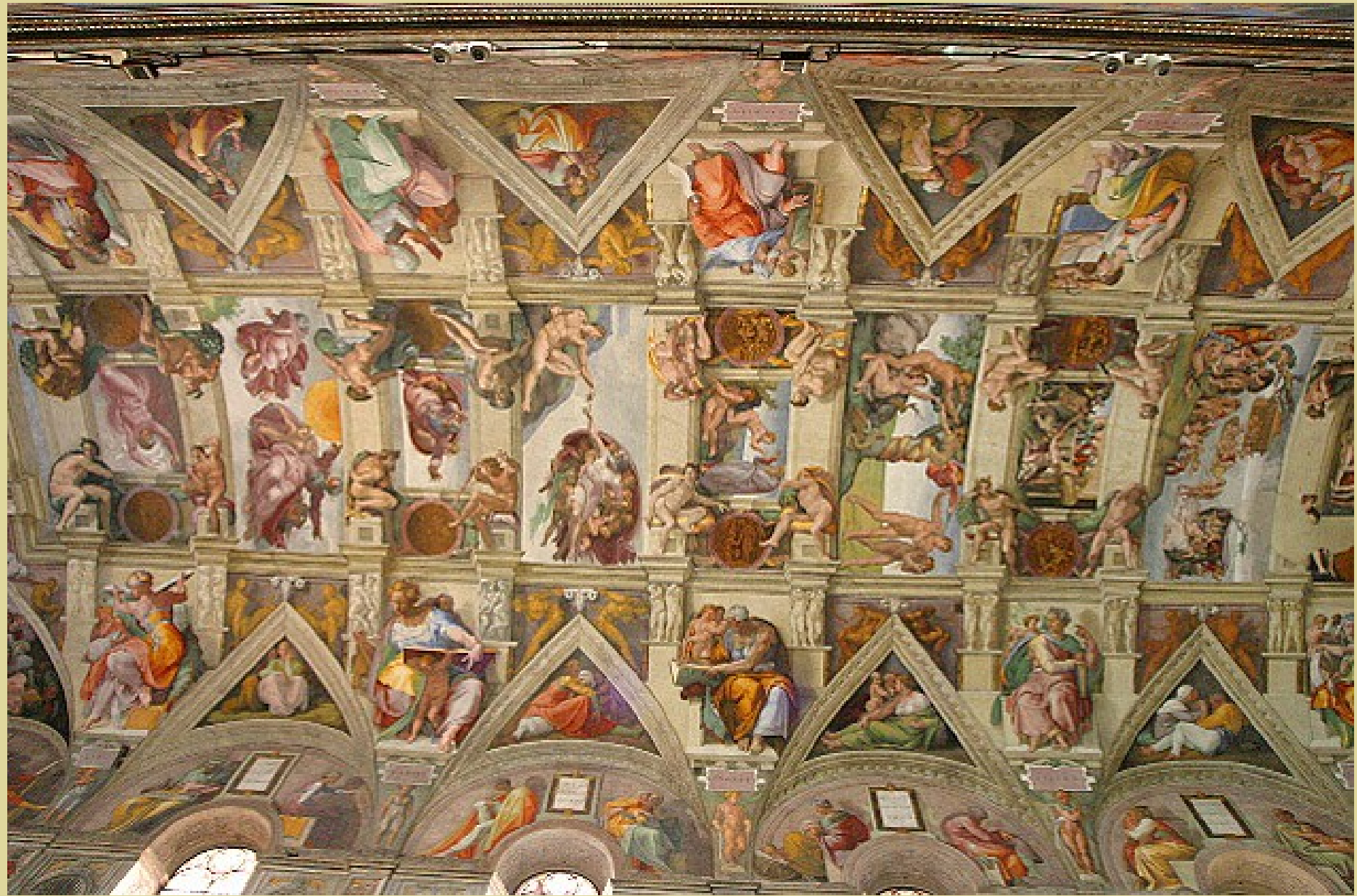
The Sistine Chapel ceiling in Rome.