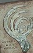
HOPEWELL MICA ARTIFACT