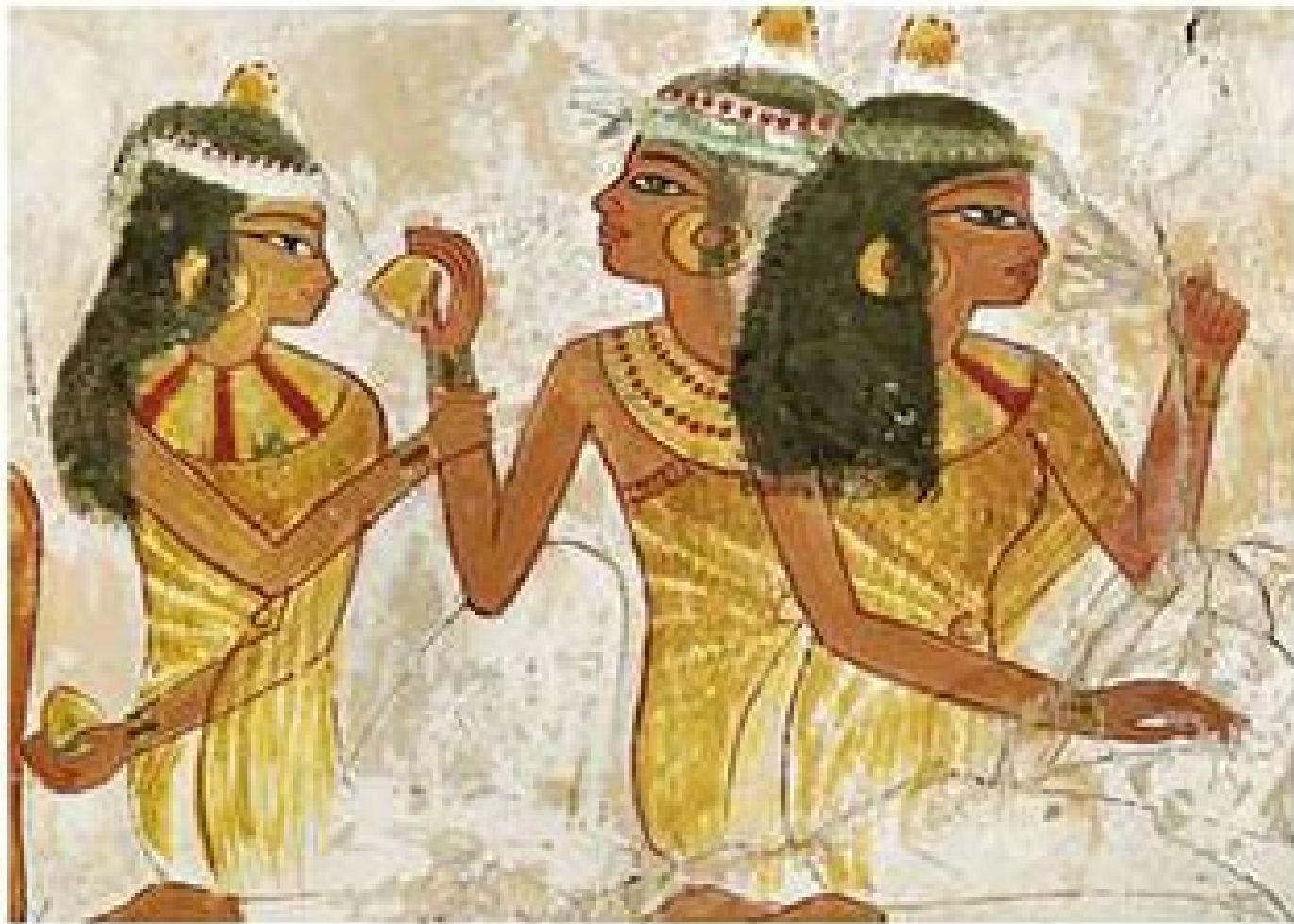
EXAMPLES OF EGYPTIAN AND ROMAN WALL ART