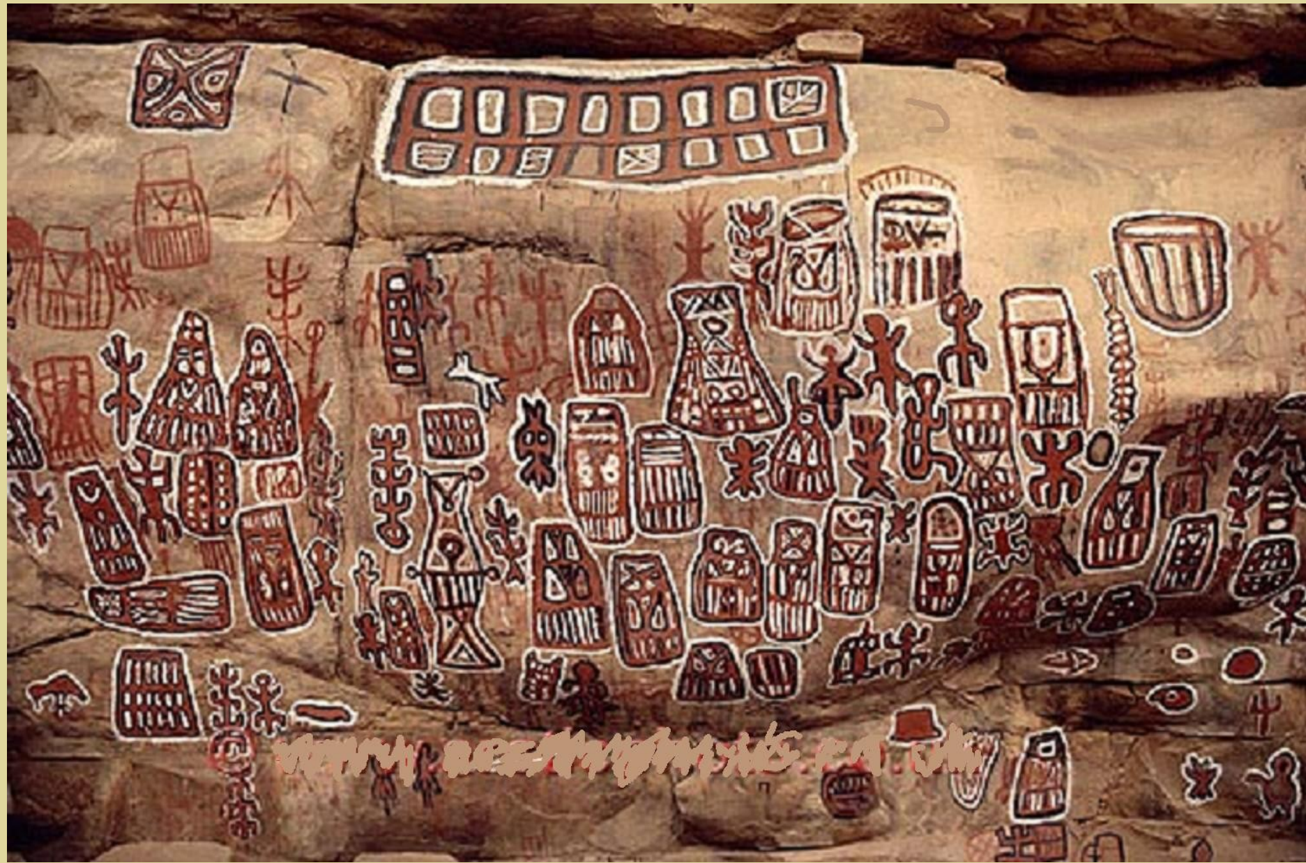
Mali, West Africa.