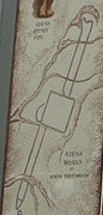
ADENA WORKS WITH RECTANGULAR PLATFORM