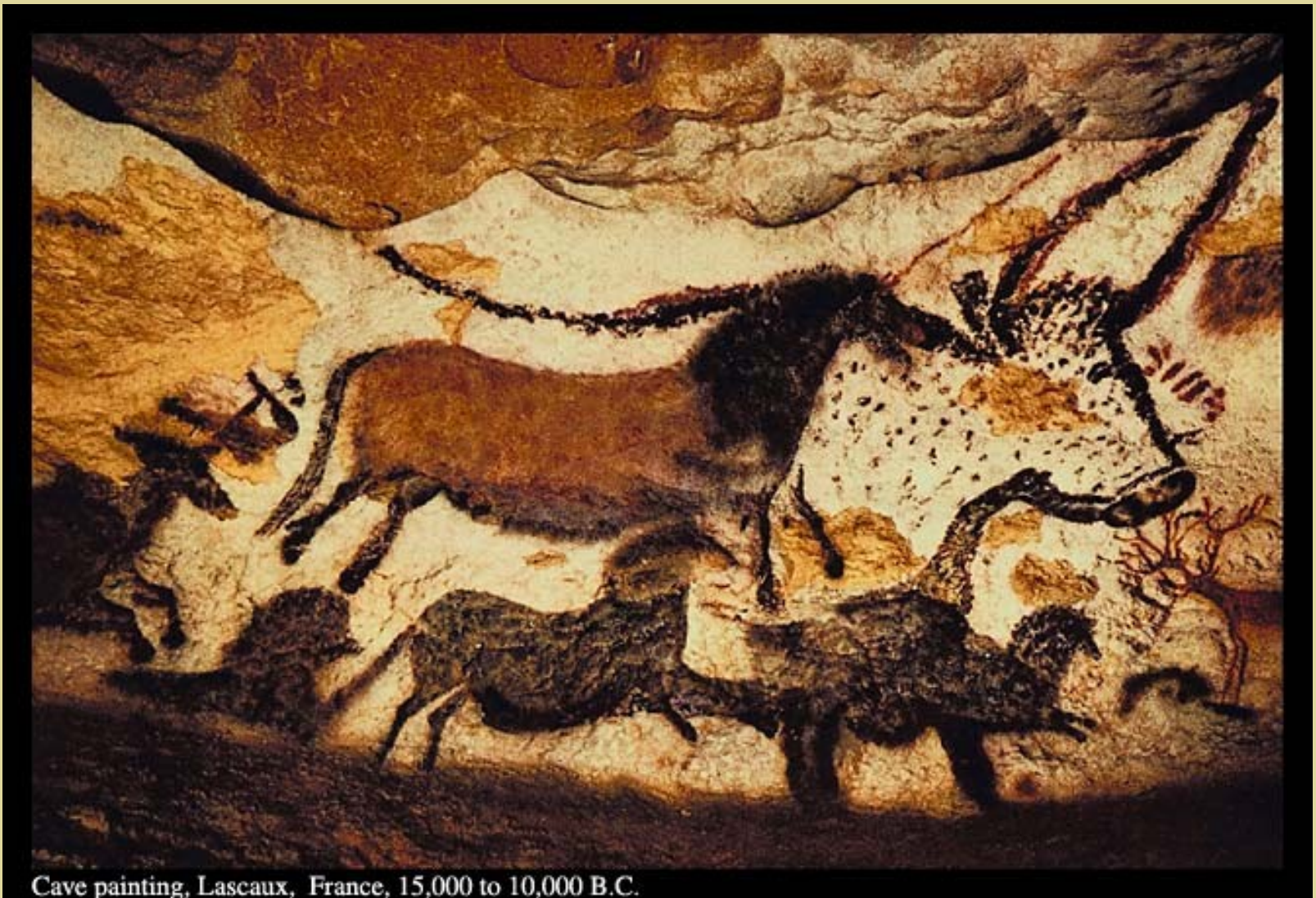
Cave painting, Lascaux, France, 15,000 to 10,000 B.C.

Mankind has created works of art on walls from early times. For example, these images of wild animals, on the wall of a cave in France, were produced using naturally-occurring pigments such as yellow ochre.