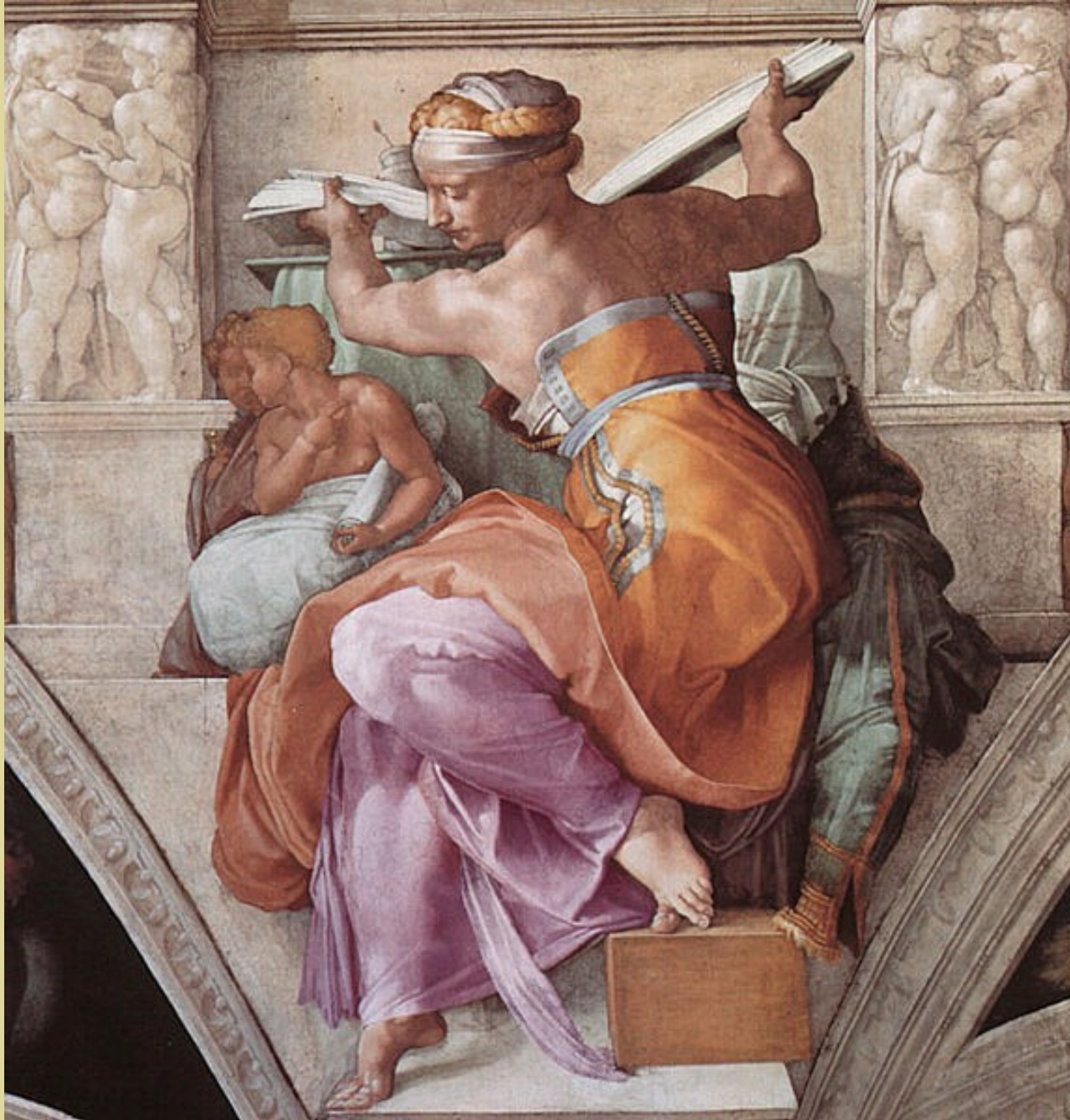
Part of the Sistine Chapel ceiling.