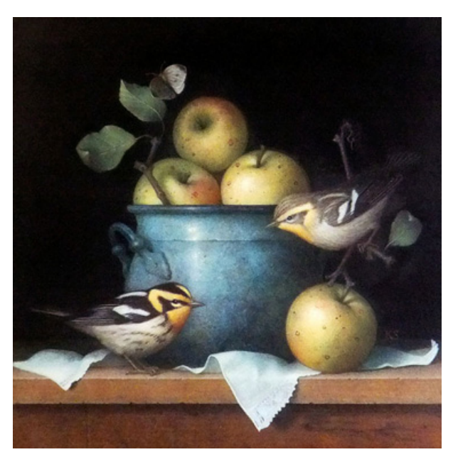
Apples and Blackburnian Warblers egg tempera (no oil), 10 <sup>3</sup>/<sub>4</sub> x 10 <sup>3</sup>/<sub>4</sub>, 2012

Interest in egg tempera continues to grow. In 1997 artists Michael Bergt and Lora Arbrador formed a new "Society of Tempera Painters". They developed a web site that offers information on the history, technique, and materials of tempera painting as well as examples of contemporary artists' works. The website also has an interactive forum where people can ask questions and discuss topics on tempera. The mission statement for the new organization is the same as that of the original society: "The improvement in the art of tempera painting by the interchange of the knowledge and experience of the members".