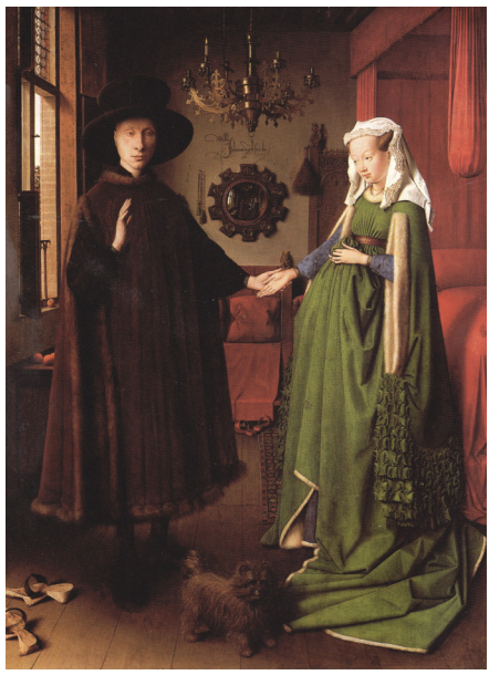
Giovanni Arnolfini and His Bride.

One of the consequences of the preeminence of oil paint was the subsequent lack of knowledge of tempera, and the incorrect description (begun by Vasari and continuing to this day) of many Renaissance egg tempera paintings as oils. Confusion persists. I have seen Jan Van Eyck's <u>Giovanni Arnolfini and His Bride</u> in the National Gallery in London described in different texts as egg tempera, tempera with oil, and oil.<sup>4</sup>