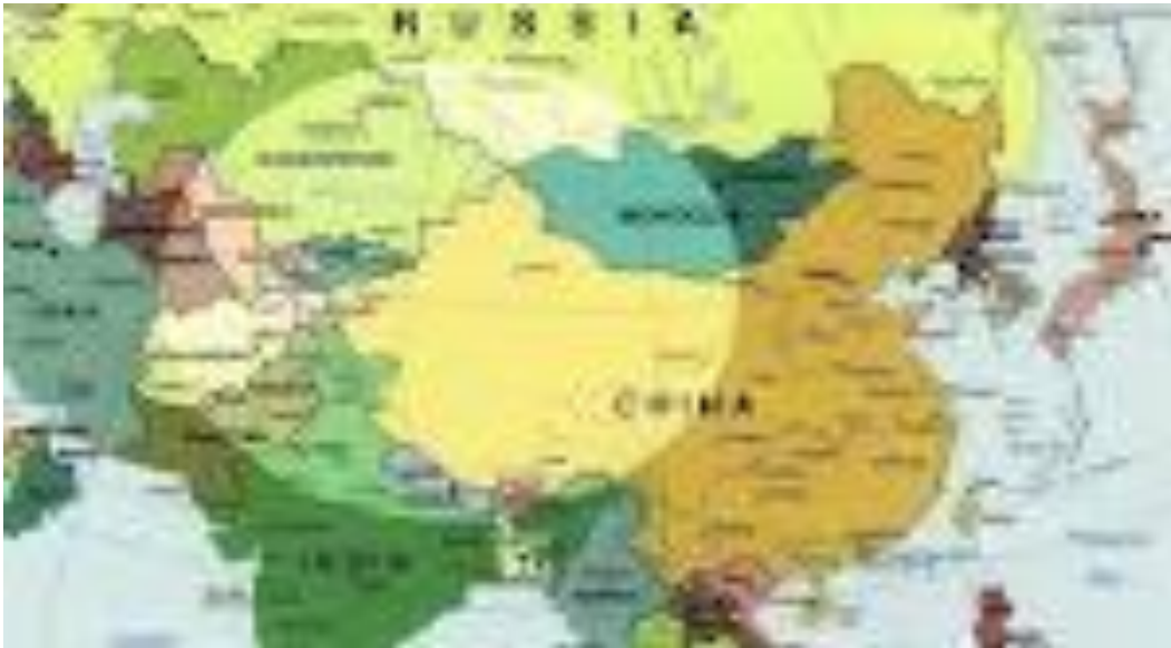
Fig. 2. Map of Central Asia

http://www.centralasiatravel.com/images/central_asia_big.jpg