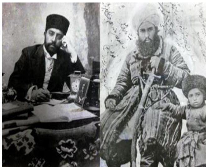
Fig.3. The Great Game's imagery

Starting with the location, it is important to recognize that it is this element that enables the continuity between the two Great Games. Although they do not exactly coincide in terms of 'geographical location', there is no denying that both occurred in the same region. Of course, the term region may prove to be somewhat vague and relative, as it always depends on the criteria of the evaluator. If we base ourselves on the historical references inherent to the Great Game , we find that they are able to mention specific places such as the Pankisi Gorge (in Northeast Georgia), or others far vaster and vaguer: the Eurasian continent (Fromkin, 1980). Faced with such ambiguity, a certain amount of overlapping is inevitable concerning the geographical context of one and the other game. On the other hand, there is no way around the geographical similarities of both games, if we consider the importance that Afghanistan had within the framework of the Great Game , and which it still continues to have on the (economic, political, military and cultural) imperatives of the New Great Game . It is important to note, however, that the exact geographical area - which is mentioned by a large body of literature about the New Great Game - corresponds to the Caspian Sea basin, located hundreds of miles west of Afghanistan (Kelly, 2000).