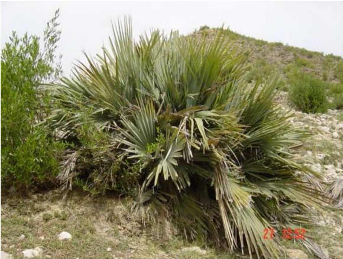
Fig. 1. Mazri Palm.