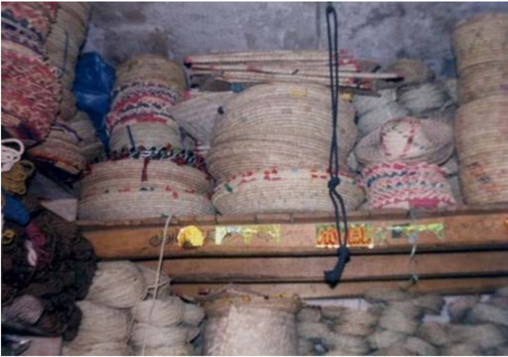
Fig. 2. Some products made from mazri palm.