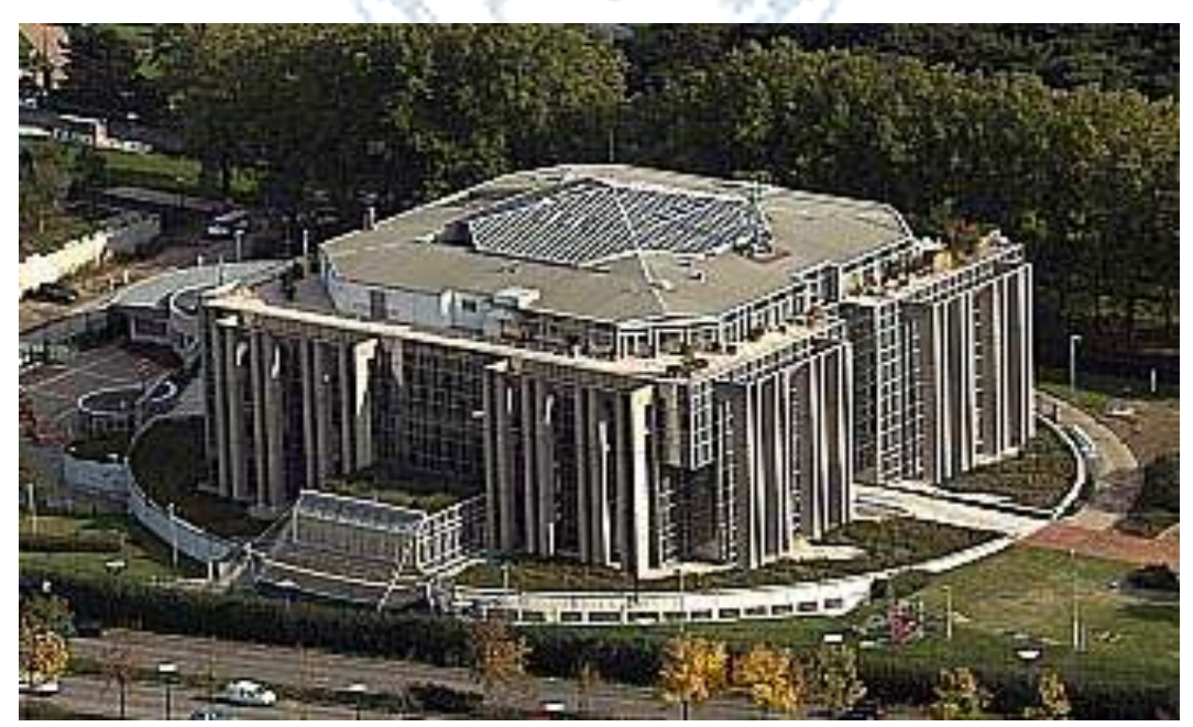
INTERPOL Secretariat General, Lyon, France

Officially created in 1923, INTERPOL – the International Criminal Police Organization – has seen its membership grow steadily over the years. Today, 190 member countries work together on a daily basis, using the databases, tools and secure communications systems that the Organization offers.