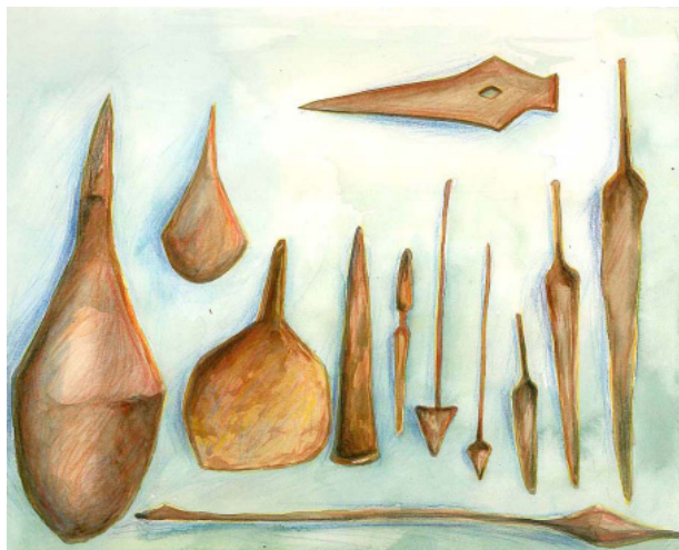
Figure 0.4 Chalcolithic Age Metal Weapons

Humans had come a long way from their food gathering and stone implement days. Yet they were not satisfied. Soon they discovered a metal called copper. This period now came to be called the Chalcolithic Age. In this age people began to use copper for making implements. Do you remember reading that in order to make clay pottery, the early humans used fire? It is used till today in the form of furnaces. Copper was the first metal to be melted by heat in order to make implements.