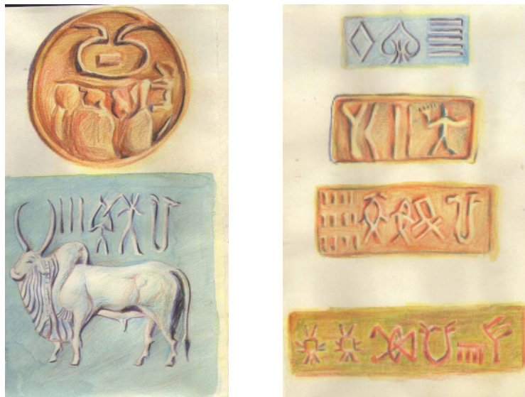
Figure 0.5 Harappan Inscriptions

skills in making crafts like Pottery , leather-work and masonry . People would get together at a convenient place to exchange their products. Even the farmers would come to sell their surplus grains and buy other necessities. These activities happened at a central place. At this stage of civilization, people looked for more than just satisfying their need for food and engaged in other activities such as weaving, pottery and metal works. It was also the stage when iron was being discovered. Now there arose a need for structure and categorization into smaller and specialized groups. Division of labour took place on the basis of the work performed by them. Humans were now ready to move to the next stage of their existence and development. The invention of writing was a great step forward. Knowledge could now be passed forward from one generation to another. Writing was also needed for keeping records by the traders as also by the people who were looking after law and order in the villages, towns and cities.