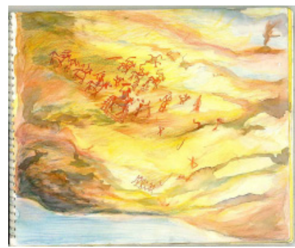
Figure 0.1 Bhimbetka Cave Paintings