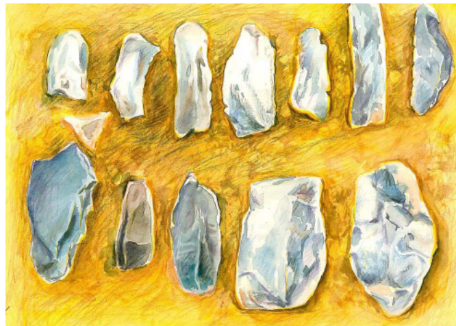
Figure 0.2 Mesolithic flint weapons

and hand axes with which they cut down small trees. They used it to kill animals for food or build small huts for themselves. They clipped smaller stones to make them as sharp as a knife. By attaching them to bows and spears , they made these tools more effective. Now they were able to hunt animals from a safer distance. Some of these stone implements have been found in Punjab, Kashmir Valley in the foothills of the Himalayas and in the Narmada Valley among other places. If you can visit the library and refer to some books or search the internet, you will be able to locate some other sites where these tools can be found across the world.