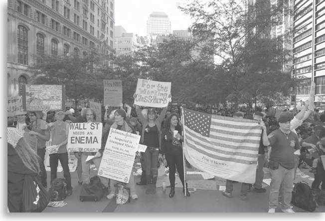
▲ Photo 4.4 How might the Occupy movement be an example of both Deviance in the Streets and Deviance in the Suites?

Langman, a sociologist, explains how the Wall Street bailout, in which the federal government committed some $700 billion in taxpayer money to rescue Wall Street banks, showed power differences in the extreme, with wealthy corporations offered enormous financial assistance while middle- and working-class citizens lost their homes, their jobs, and their hope.