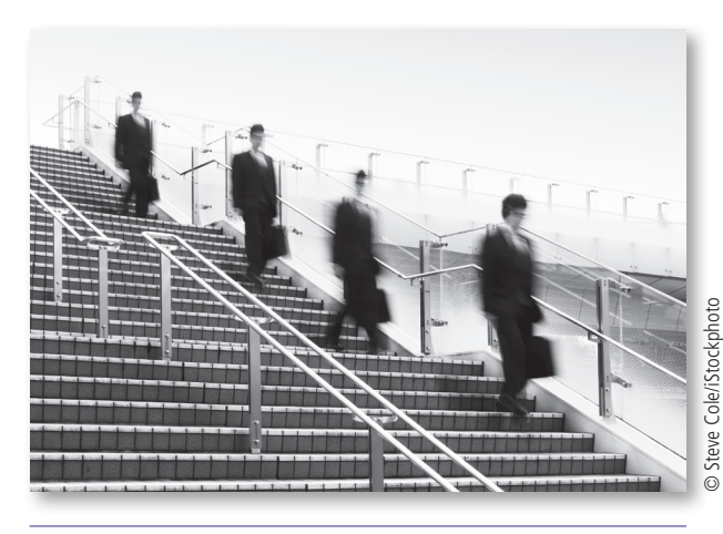
▲ Photo 4.1 This photo might represent either conformity or ritualism in Merton's adaptations. Which concept do you think it best illustrates? Why do you think so?

Retreatism is the adaptation of those who have rejected the cultural goal of success/wealth attainment and have also rejected the legitimate means. Merton describes people who adapt in this way as "in the society but not of it. Sociologically, these constitute the true aliens" (Merton, 1957, p. 153). The chronically homeless and serious drug addicts might be considered retreatists in this model. Christopher McCandless, from this chapter's opening story, is a vivid individual example of a retreatist. He clearly rejected the conforming goals and lifestyle of his parents and the larger society;