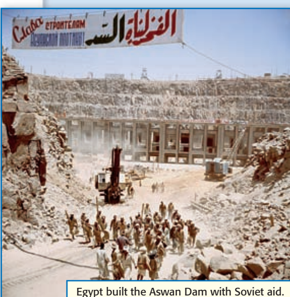
Major Strategies of the Cold War