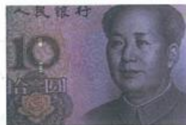
十元 (块) ten yuan/kuai