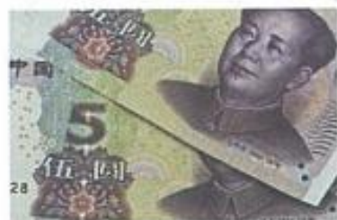
五元 (块) five yuan/kuai