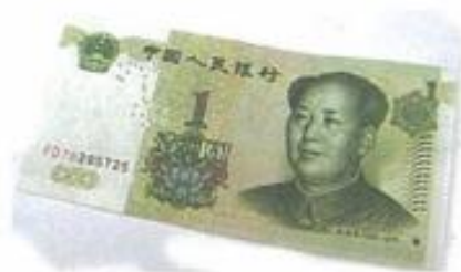
一元 (块) one yuan/kuai

The basic unit of renminbi is “元yuan”, usually replaced by “块” (kuài ) in spoken Chinese.