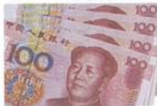
一百元 (块) one hundred yuan/kuai