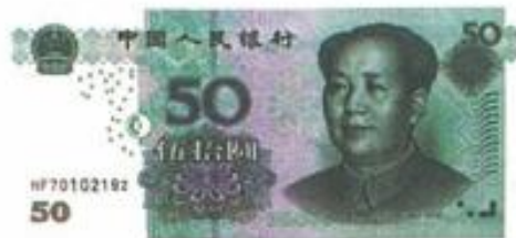
五十元 (块) fifty yuan/kuai