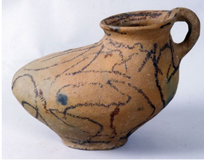
Figure 6: A Culinary Shoe Pot from Oaxaca, Mexico. Catalog Number 2009-117/536

Archaeological studies in Central America have revealed that the invention of a particular type of pottery known as the “culinary shoe pot” may have been the technological breakthrough needed to boil beans. The pots are used by placing the “foot” of the pot in the coals of a fire so heat can be transmitted through the vessel for long periods of time. Pots of this design have been found in the archaeological record throughout Central America in sites dating to the same period as the beginning of bean domestication and pots of similar design continue to be used throughout that region today. This example demonstrates the extent to which the expansion of the human diet has been linked to innovations in other areas of culture.