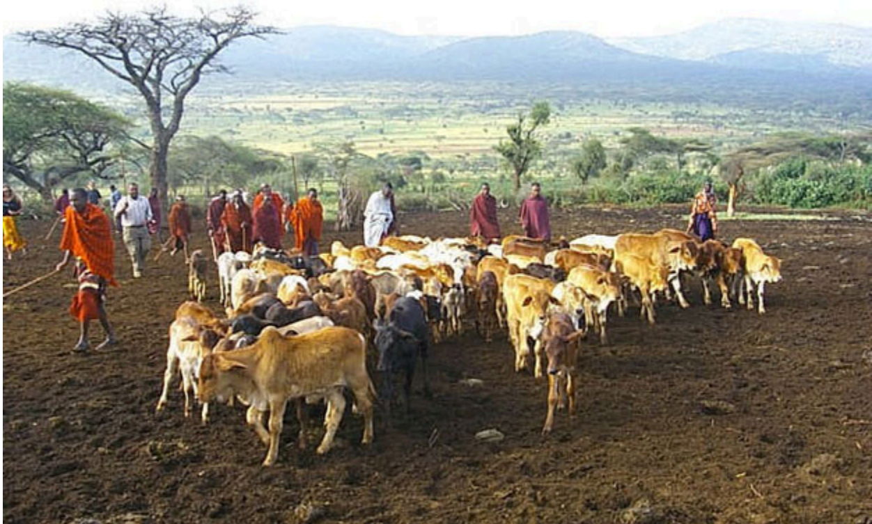
Figure 4: A Typical Maasai Herd: Although women do most of the work of tending the herd, only men are allowed to own cattle

A community of animal herders has different labor requirements compared to a foraging community. Caring for large numbers of animals and processing their products requires a tremendous amount of work, chores that are nonexistent in foraging societies. For pastoralists, daily chores related to caring for livestock translate into a social world structured as much around the lives of animals as around the lives of people.