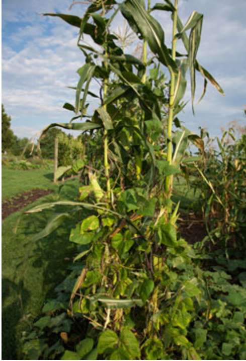
Figure 5: Bean plants grow up the stalk of a corn plant, while squash vines grow along the ground between corn stalks, inhibiting weed growth, an innovative technique developed by indigenous farmers in the Americas thousands of years ago.

Growing crops in the same location for several seasons leads to depletion of the nutrients in the soil as well as a concentration of insects and other pests and plant diseases. In agricultural systems like the one used in the United States, these problems are addressed through the use of fertilizers, pesticides, irrigation, and other technologies that can increase crop yields even in bad conditions. Horticulturalists respond to these problems by moving their farm fields to new locations. Often this means clearing a section of the forest to make room for a new garden, a task many horticulturalists accomplish by cutting down trees and setting controlled fires to burn away the undergrowth. This approach, sometimes referred to as “slash-and-burn,” sounds destructive and has often been criticized, but the ecological impact is complex. Once abandoned, farm fields immediately begin to return to a forested state; over time, the quality of the soil is renewed. Farmers often return after several years to reuse a former field, and this recycling of farmland reduces the amount of forest that is disturbed. While they may relocate their farm fields with regularity, horticulturalists tend not to move their residences, so they rotate through gardens located within walking distance of their homes.