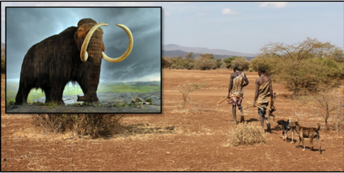
Figure 3: The woolly mammoth was hunted to extinction in North America at the end of the last ice age. It is likely that dogs played a critical role in hunting these and other large game animals.