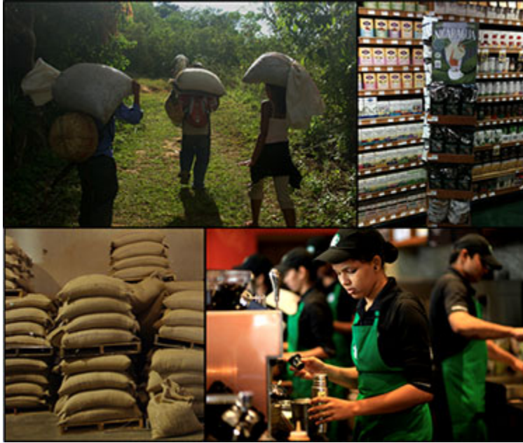
Figure 9: Links in the Commodity Chain for Coffee: As the coffee changes hands from the growers, to the exporters, to the importers, and then to the retail distributors, the value of the coffee increases. Consider the differences in wage between these workers.

circulate around the globe. In the world system, complex chains of distribution separate the producers of goods from the consumers. Agricultural products travel long distances from their points of origin to reach consumers in the grocery store, passing through many hands along the way. The series of steps a food like apples or coffee takes from the field to the store is known as a commodity chain .