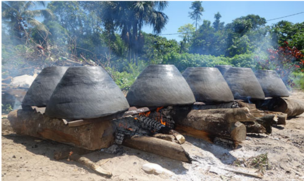
Clay Cooking Pots in the Republic of Suriname.

Archaeological studies in Central America have revealed that the invention of a particular type of pottery known as the “culinary shoe pot” may have been the technological breakthrough needed to boil beans. The pots are used by placing the “foot” of the pot in the coals of a fire so heat can be transmitted through the vessel for long periods of time. Pots of this design have been found in the archaeological record throughout Central America in sites dating to the same period as the beginning of bean domestication and pots of similar design continue to be used throughout that region today. This example demonstrates the extent to which the expansion of the human diet has been linked to innovations in other areas of culture.