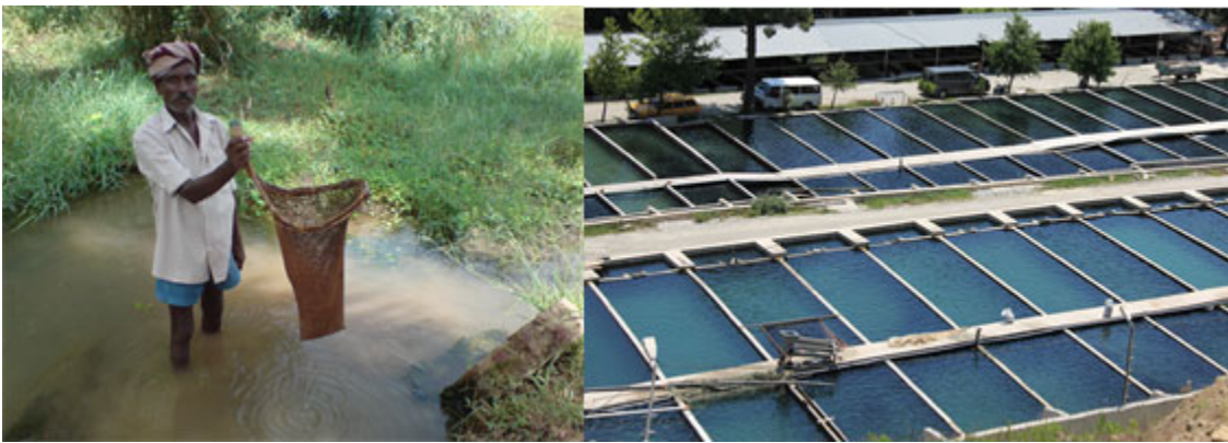
Figure 2: These images show how fish are harvested in two different subsistence systems. Consider the amount of investment and labor that went into the development of technologies that make mass fish farming, or aquaculture, possible compared to fishing with simple nets.

eral different fields, including biology, chemistry, and ecology, as well as a range of ethnographic techniques. This interdisciplinary perspective allows for cross-cultural comparison of human diets. In several decades of anthropological research on subsistence systems, anthropologists have observed that the quest for food affects almost every aspect of daily life. For instance, every person plays a role in society as a producer, distributor, or consumer of food. In the journey of a fish from the sea to the plate, for instance, we can see that in some societies, the same person can fill more than one of those roles, while in other societies there is more specialization. In a small fishing village, the same person might catch the fish, distribute some extra to friends and family, and then consume the bounty that same day. In a city, the consumer of the fish at a fancy restaurant is not the same person who caught the fish. In fact, that person almost certainly has no knowledge who caught, cleaned, distributed, and prepared the fish he or she is consuming. The web of social connections that we can trace through subsistence provide a very particular kind of anthropological insight into how societies function at their most basic level.