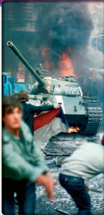
▲ Czech demonstrators fight Soviet tanks in 1968.

In 1989, after Communists lost control of Hungary's government, Nagy was reburied with official honors.