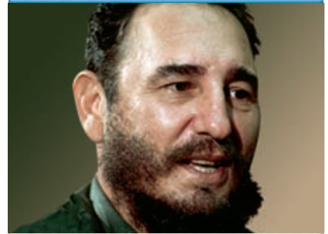
Fidel Castro 1926–

The son of a wealthy Spanish-Cuban farmer, Fidel Castro became involved in politics at the University of Havana. He first tried to overthrow the Cuban dictator, Batista, in 1953. He was imprisoned, but vowed to continue the struggle for independence: