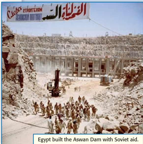
Egypt built the Aswan Dam with Soviet aid.

During the Cold War, the United States and the Soviet Union both believed that they needed to stop the other side from extending its power. What differentiated the Cold War from other 20th century conflicts was that the two enemies did not engage in a shooting war. Instead, they pursued their rivalry by using the strategies shown below.