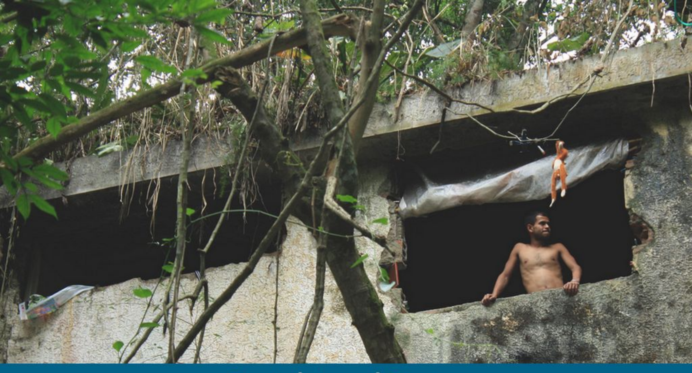
2. Achieved Status -refers to a social position that is assumed voluntarily and that reflects a significant measure of personal ability and efforts