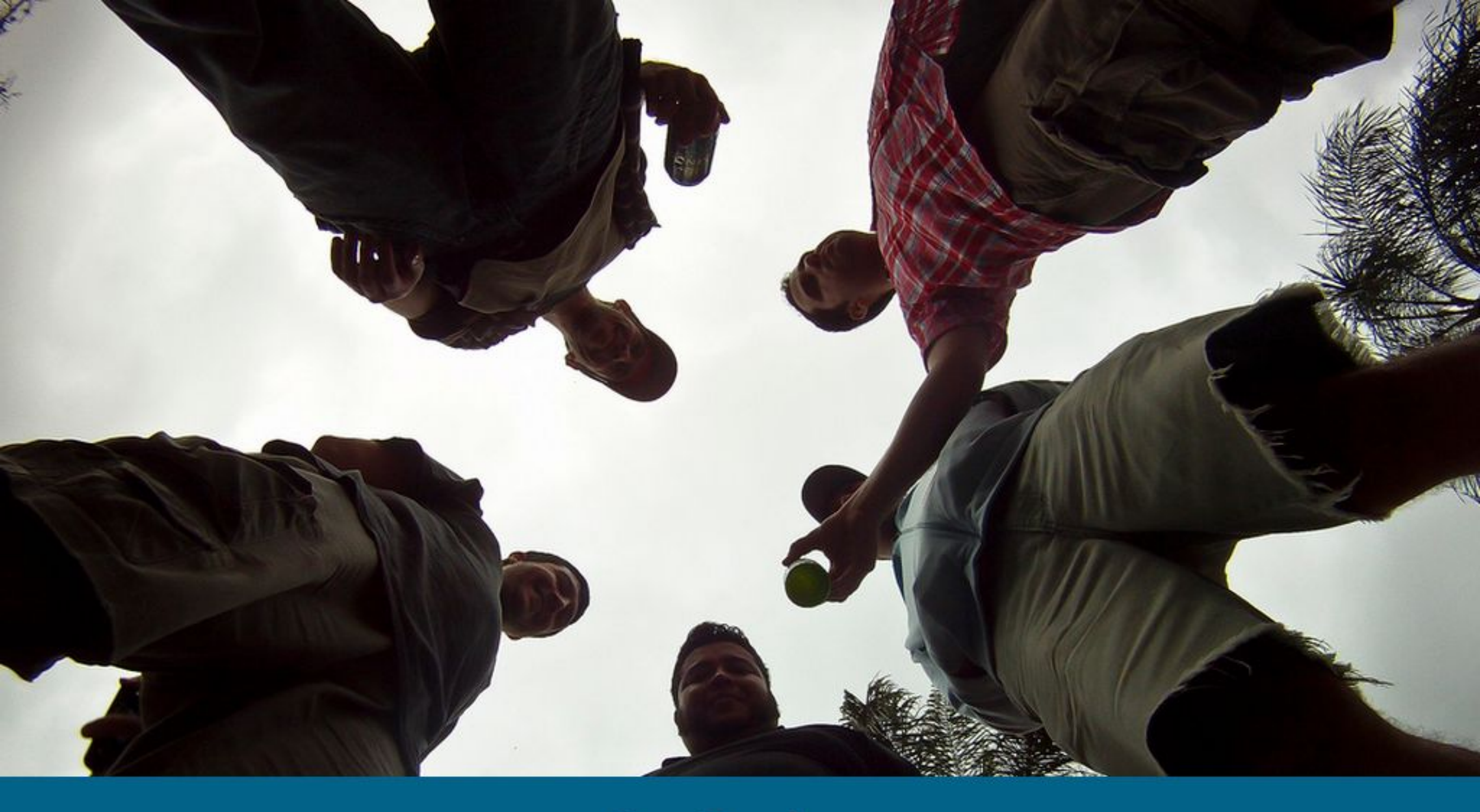
3. Roles -refers to patterns of expected behavior attached to a particular status.