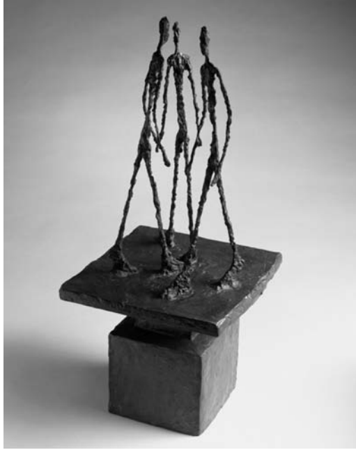
Three Men Walking II , sculpture, Albert Giacometti, Bronze; H. 30–1/8, W. 13, D. 12–3/4 inches