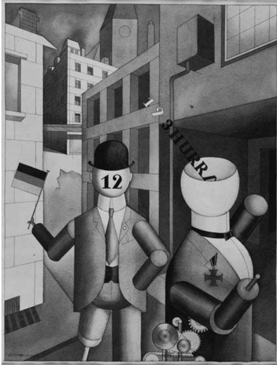
Grosz, Republican Automatons (1920)

and extreme facial expressions. Expressionism contained the aspirations and idealism of the nineteenth century's prosaic world of urban life; but it was also colored by an ironic self-awareness of urban limitations. Expressionists, writes Peter Gay, "lived off the city, responding to it as a devouring monster, a trigger for the widest fantasies, an unsurpassed stage for love and loneliness." 335 Strindberg paved the foundation for Expressionist drama: Stationendrama (locales at different "stations") broke up the realistic parlor scene; emphasis on heightened emotionalism manifested in the Schreidrama ( cri du coeur ); and stress on the primacy of the individual against the herd – all derivative of Strindberg. This last point was also the result of Der Neue Mensch (The New Man), a movement that would resist the encroachment of modern pressures through a call of universal brotherhood. This brotherhood was not, however, an attempt towards conformity, but rather a desire to unite against the increasing mechanization and robotization of modern life. Kurt Pinthus wrote that Expressionism "produces its means of expression with forcefulness and violent energy through the power of the spirit (and it doesn't care about avoiding their misuses). It hurls forth its world in ecstatic paroxysms, in