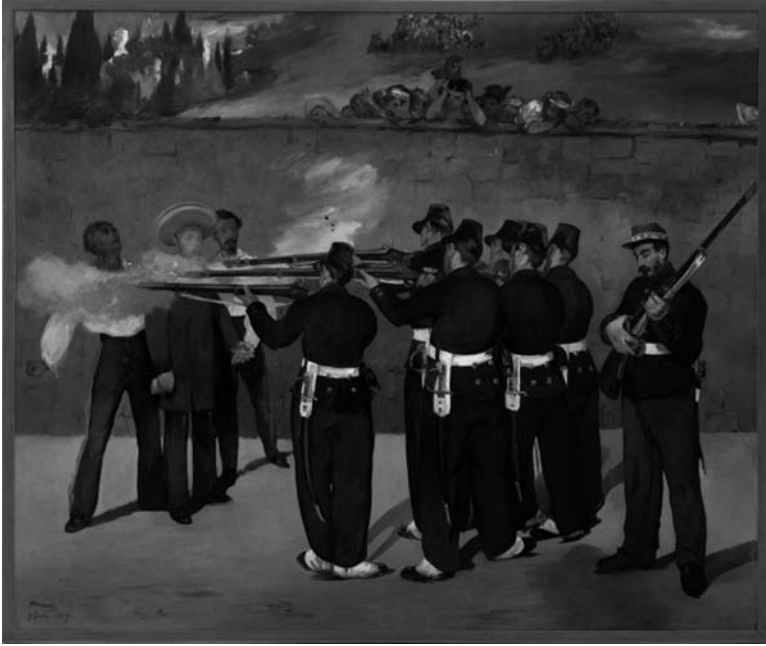
Mamet, The Execution of Emperor Maximilian , 1868–69, Kunsthalle, Mannheim

the executed Maximilian and his two aids are nonplussed; the image is photographic; and the emphasis of the final executioner loading his gun gives the sense of prolonged time – that this execution is merely one of several violent moments to occur.