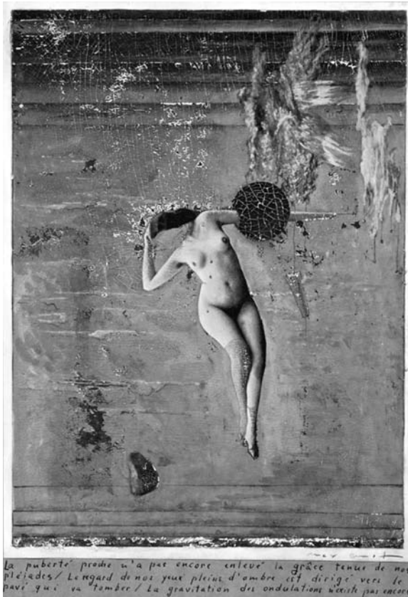
Max Ernst, Approaching Puberty , 1921

to “know” her by placing her in one alternating situation after another, designed to create a cumulative effect. Lulu, in many respects, bears the same objectification and mystery associated with Max Ernst’s Approaching Puberty (1921).