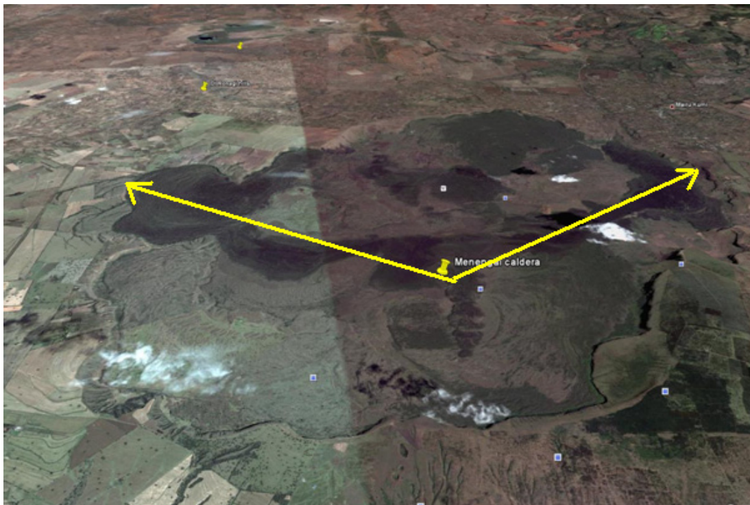
FIGURE 4: Satellite image of Menengai caldera. The dark lava flows on trachytic eruptive centres imply orientation to the northeast and northwest and these can be inferred as structures.

Geological structures (Faults and fractures). Faults and fractures always indicate movement within the earth's crust. They are distinguished from each other by whether displacement (lateral or vertical) has taken place; faults show displacement whilst fractures do not. Differences aside, the mapping of these structures needs to be done meticulously due to the fact that these structures may easily be confused with simple erosional surfaces. Erosional surfaces may sometimes be an indication of an underlying structure. The disparity is whether any observable disturbance can be seen in the bedrock. Structures like geological features may not always be obvious on the surface. In volcanic areas, they may manifest as volcanic centres or fumaroles oriented in a linear direction which become obvious once a map is compiled. Thus it is imperative to be accurate in measuring all formations and structures with well calibrated equipment so that if extrapolations are to be made for modelling purposes the error margin is very slim.