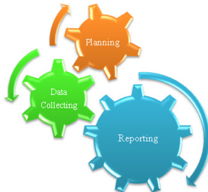
FIGURE 2: Phases of geological field mapping

Field mapping projects are carried out in three phases which have a stepwise relationship.