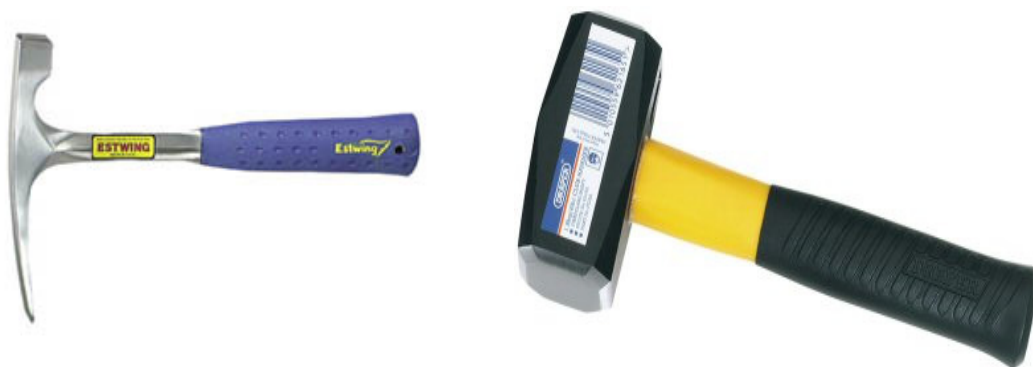
FIGURE 3: Chisel head and crack geological hammers