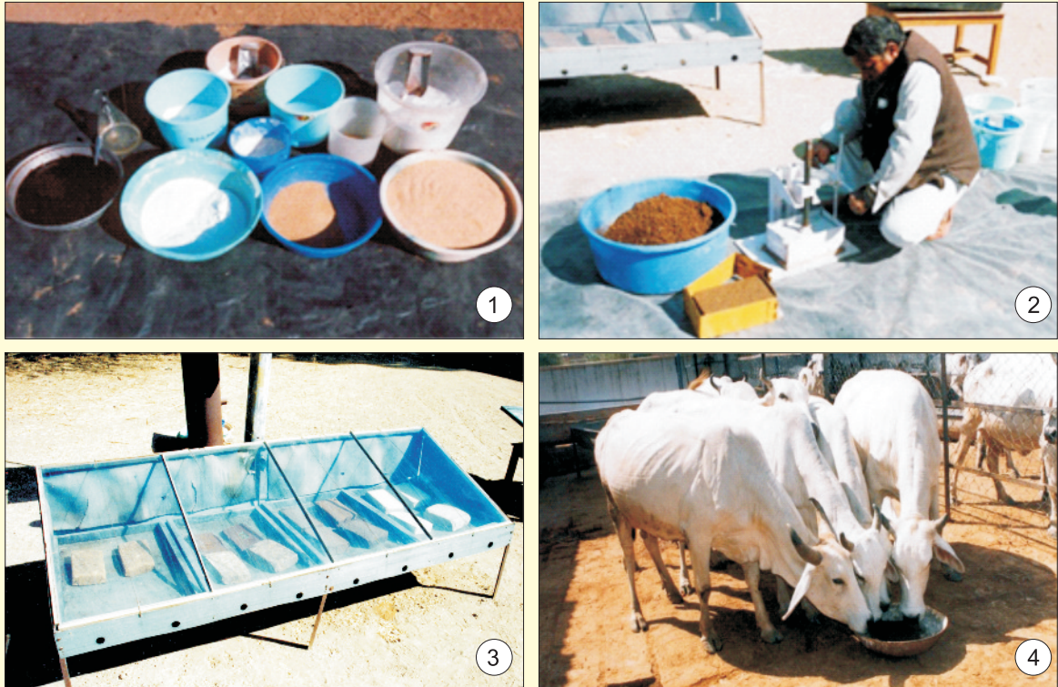
Plate. 2. Feed-block Ingredients and Production

material hence there is no exothermic reaction during mixing of the ingredients. This facilitates manual mixing of block ingredients. Products can be dried under the sun light or in the solar drier, and finished product maintains its quality. It has been observed that its acceptance is not adversely affected with the time. The principal feed ingredients, which are used for production of standard formulation feed block, and alternative feed ingredients have been listed in Table 9. Detailed, step-by-step production of multi-nutrient feed block has been shown in Plate 3. Feed block production technology involves: A. manual mixing (or mixing in electric operated mixer) of feed-ingredients, B. pressing in screw type press (or power driven hydraulic press), C. drying in open sun (solar/electric/gas operated dryer) and packing in printed wrapper then finally kept in an appropriate paper box. For production of 50 blocks of 2 kg each, 52 kg molasses, 5 kg urea dissolved in 5.0 l water, 37.5 kg wheat bran, 6.0 kg guar meal, 5.0 kg each of common salt, vitamin-mineral mixture and dolomite, along with 1.2 kg guar gum dust/powdered fenugreek seeds, used as a binder, is required. It has been stated that