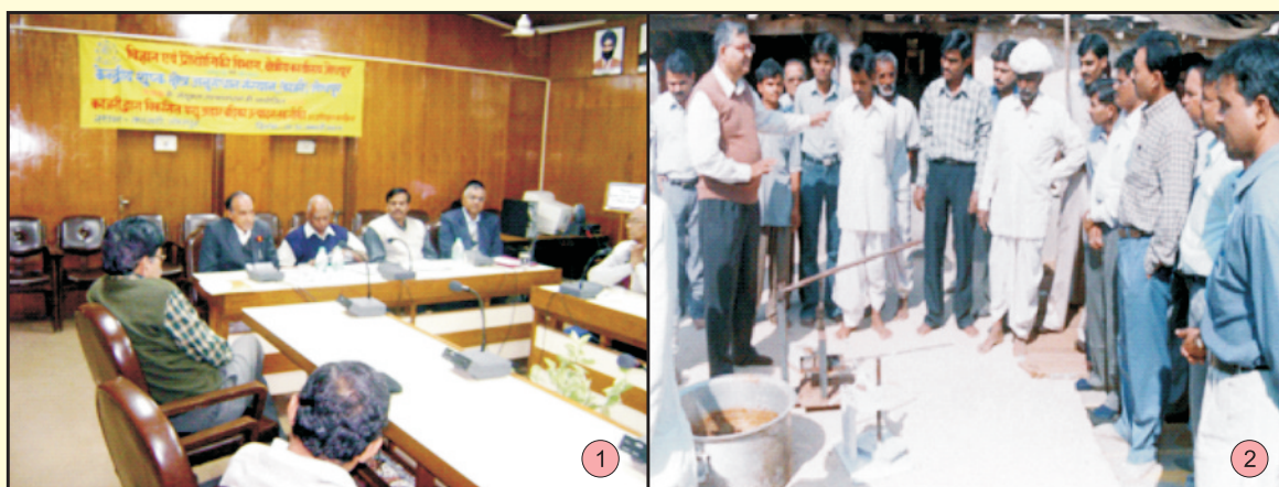
Plate. 10. On- and Off-farm Trainings for Farmers' and Entrepreneurs

The supplement feed and its production technologies developed at CAZRI have been evaluated under Institute Village Linkage Programme (IVLP) of National Agricultural Technology Projects (NATP). Farmers, unemployed rural youths and school drop-outs have successfully adopted the technology for commercial production of feed-blocks and nutrient-mixture in villages. The feed block production technology has been disseminated among the farmers and entrepreneurs through organizing 'on-campus' and 'on-farm' trainings (Plate 10), farmers' fairs, field days, exhibitions and arranging exposure visits of the livestock owners and unemployed rural youths.