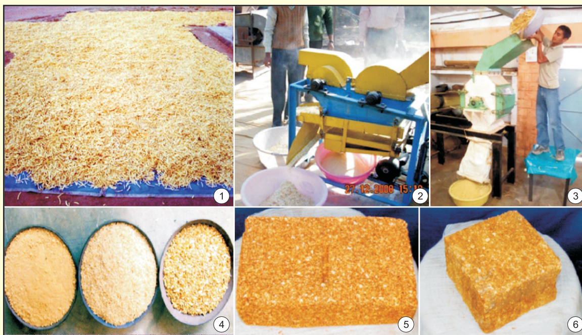
Plate. 9. Milling of Prosopis juliflora Pods for Production of Supplemental- and Complete-block

Recently, technologies for processing of Prosopis juliflora pods have been developed at CAZRI using modified Multi-purpose Plot Thresher (MPPT) and Full Circle Hammer Mill (FCHM) by which different value added pod fractions can be obtained (Plate 9). These milling products can be used for production of various animal feed products (Bohra et al , 2010). The milling process involves collection of mature pods