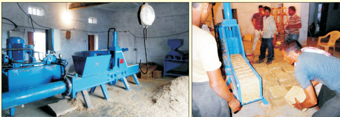
Plate. 11. Complete Feed Block Machine at Gaushala , Harsolav Village (Nagaur)

Recently under National Rainfed Area Authority (NRAA) funded Project entitled "Piolet Study on Livestock Centric Intervention for Livelihood Improvement in Nagaur District of Rajasthan" the Complete feed block Machine (Plate 11) with Feed-fodder Mixer and feed Grinder have been installed at Sant Bhuria Baba Gaushala , Harsolav village. The main aim of this feed technology is to demonstrate the significance of feeding of complete feed blocks under scarcity and drought period of arid region of the country. Since the poor quality of forage and crop residues are only available during such situation, which are often low in protein, energy, minerals and vitamins. However, these fodder