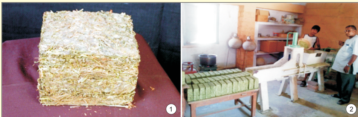
Plate. 8. Production of Lucerne Meal Block

Lucerne is a high input intensive but valuable fodder crop. It is a rich source of protein, minerals and other critical nutrients including beta-carotene, which is a known precursor of vitamin A. But due to high moisture contents, its shelf life is very short. It is estimated that 20-25% of field harvested Lucerne is spoiled and can not be used. The harvested Lucerne is chopped, loosely spread over wire-mesh and dried in the sun. This is then milled in hammer mill and compressed in fodder block making machine to produce 1 kg block (Plate 8). Such dried blocks are rich source of protein, beta-carotene, calcium and other critical nutrients. As such basis, the Lucerne meal block contained, 91.8% dry matter, and on dry matter basis, it contained, 84.4 organic matter, 23.5% crude protein, 3.2% ether extract, 15.6% minerals, 57.7% total carbohydrates, and 402 kcal% gross energy. These blocks can be used as a supplement to desert livestock maintained on dry roughage diet.