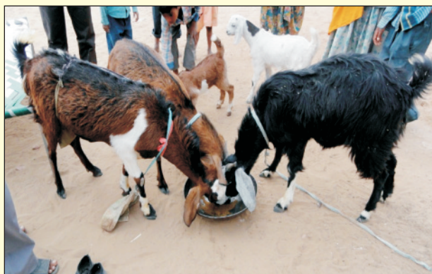
Plate. 4. Multi-nutrient Mixture is Beneficial in both Small and Large Ruminants

In spite of the fact that the feed blocks are well accepted by the livestock of all the categories and its immense use in supplementation of essential nutrients, these are unsuitable for the browsers like goats who instead of licking such blocks try to bite it due to their nibbling habit. Formulation and technology for production of multi-nutrient mixture have been standardized for such type of animals. It involves mixing of all desired ingredients shown in Table 3, and then spread over polythene sheet under the sun for drying. After proper drying it can be offered to the animals (Plate 4). The standard