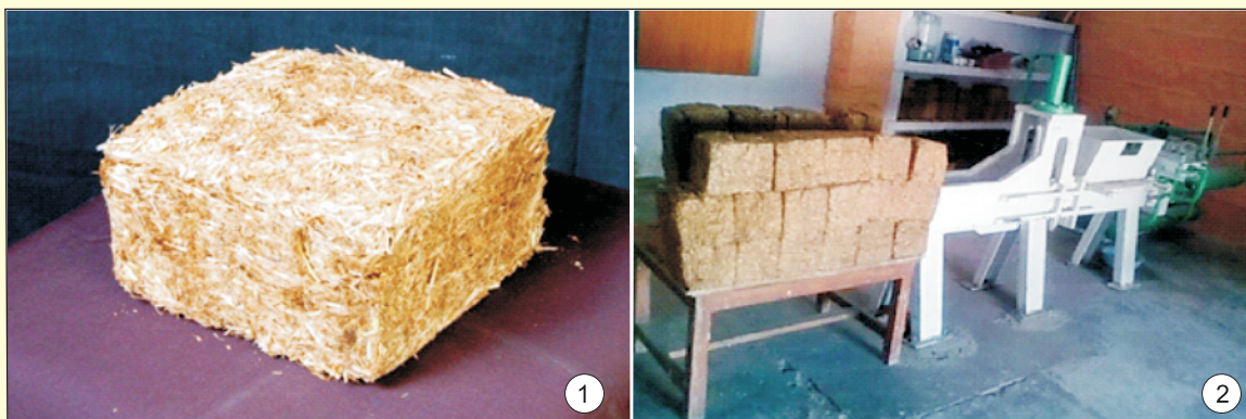
Plate. 7. Production of Fodder Block

Crop residues and dry grasses are short of essential nutrients including fermentable energy, protein, most of the macro- and micro-minerals including phosphorus and carotene, which are precursors of vitamin A, high in structural carbohydrates and calcium. Calcium-phosphorus imbalances adversely affect the availability of calcium as well as the phosphorus and other micro-minerals. Their palatability and digestibility are also low. Such crop residues can be converted into valued feeds by incorporation of required feed ingredients and then compressed to produce a 2-kg block (Plate 7).