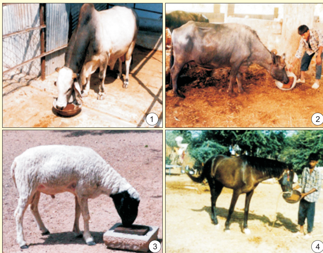
Plate. 1. Feed-block Lick for Supplementation of Critical Nutrients to Desert Livestock

There are different means of supplementation of essential nutrients to the livestock, which mainly survive on roughages. The compact feed block is one of the most appropriate means to do so (Plate 1). Beames (1963) in Australia introduced the concept of feeding compact feed blocks comprised of molasses and urea. Later on this technology was refined and brought to the field to improve productivity of the cattle by Leng and Preston (1983). Sansoucy and coworkers (1986) initiated pioneer work on the technology