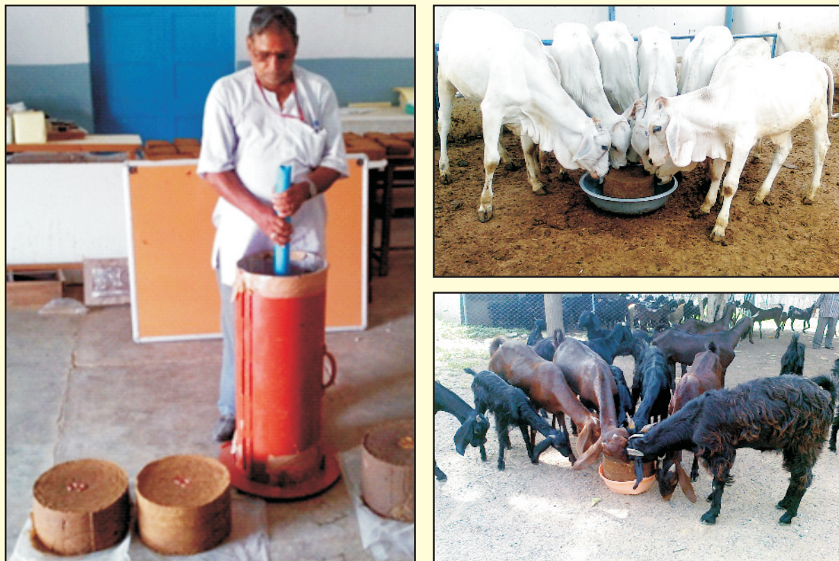
Plate. 6. Salt-lick Production for Mineral Supplementation in Community Livestock

20.5% calcium carbonate (Ca=40.0%), 49.0% di-calcium phosphate (Ca=20%, P=18.5%), 0.24% copper sulphate (Cu=25.0%, S=13.8%), 0.043% cobalt sulphate.7H 2 O (Co=21.0%, S=11.4%), ferrous sulphate.7H 2 O (Fe=21.0%, S=11.8%), 0.4% manganese sulphate (Mn=25.0%, S=19.0%), 8.3% Magnesium oxide (Mg=60.3%), 0.02% potassium iodide (K=23.5%, I=76.46%), 22.0% common salt (Na=39.3%, Cl=60.7%) and 0.834% zinc sulphate.H 2 O (Zn=36.0%, S=18.0%) . Similarly, BIS Type-II mineral mixture (without common salt) should possess <5.0% moisture, >23.0% calcium, >12.0% phosphorus, >6.5% magnesium, >0.5% iron, >0.026.0% iodine as KI, >0.077% copper, >0.12% manganese, >0.012% cobalt, >0.012% fluorine, >0.38% zinc, >0.5% sulphur and <2.5% acid insoluble ash. In these mineral mixtures, appropriate quantities of vitamins (A, D 3 , E) should be added.