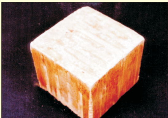
Plate. 5. Vitamin-mineral Salt Lick

facilitate the binding of the ingredients. In No. 2, neither molasses nor guar gum dust was added but in No. 3 guar gum dust was added @ 1.6%. In both 3 and 4, 300 ml water was added to facilitate mixing of salt and mineral mixture. In No. 3 and 4, binder was added @ 0.8% level. A 50% jaggery solution was also incorporated in No. 3 and 4. In No.5 dolomite was also incorporated. In No. 4 guar gum dust was added in the last, whereas, in No. 5 it was added before adding dolomite, guar gum dust and jaggery solution. The fresh and dry weight of No. 1, 2, 3, 4 and 5 formulation blocks were 2.66 and 2.38; 1.77 and 1.63; 1.78 and 1.47, 2.54 and 2.40 and 2.54 and 2.40 kg, respectively. The bulk density of these mineralized salt licks was 1.5, 1.8, 1.3, 1.5 and 1.9 g -1 cm -3 , respectively. Formulation No. 2 and 3 were brittle, and No. 4 and 5 were soft and sticky in nature due to addition of jaggery . The block made as per formulation No. 1 (Plate 5). was found