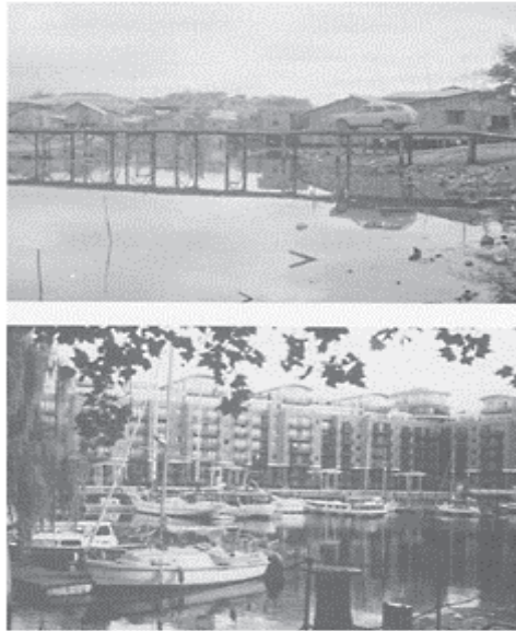
Plate 2.1 The variety of urban environments is shown by examples of ‘waterfront living’ in (top) a shanty town built on stilts over a coastal marsh in the port-city of Manta, Ecuador, and (bottom) the gentrified St Katharine’s Dock in central London