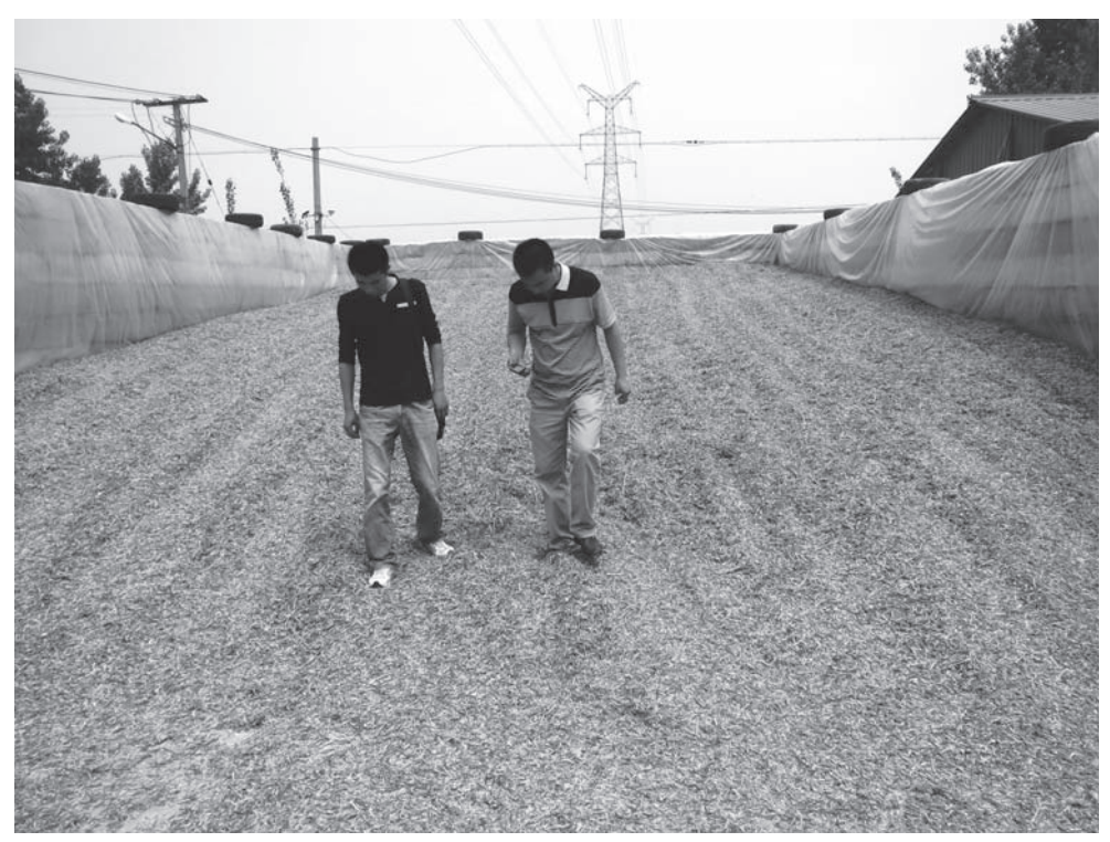
Figure 8.3: Checking the consolidation of the maize greenchop in another Asian dairy feedlot.