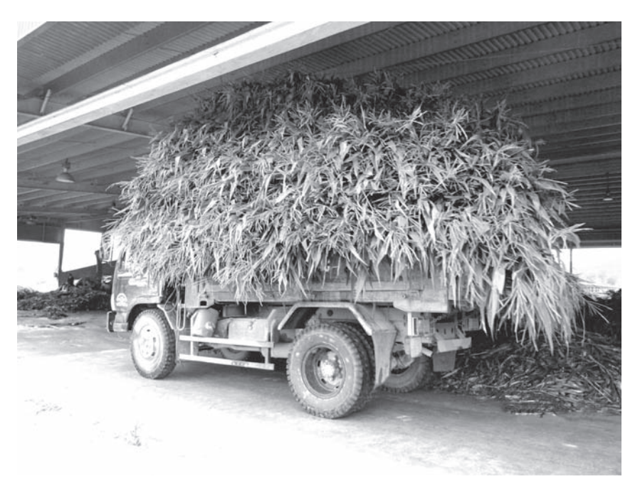
Figure 8.1: Forage maize, contract grown by local farmers, being delivered to the North Vietnam dairy feedlot for ensiling.

To produce milk and calves, dairy cows require feed nutrients that are supplied through a combination of forages and concentrates. To produce acceptable milk yields, say 15 L/day, cows require a ration containing at least 10 MJ/kg DM of