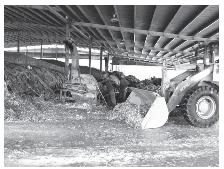
Figure 8.2: Processing the North Vietnamese forage maize through a chopper before consolidating it in a large silage bunker.