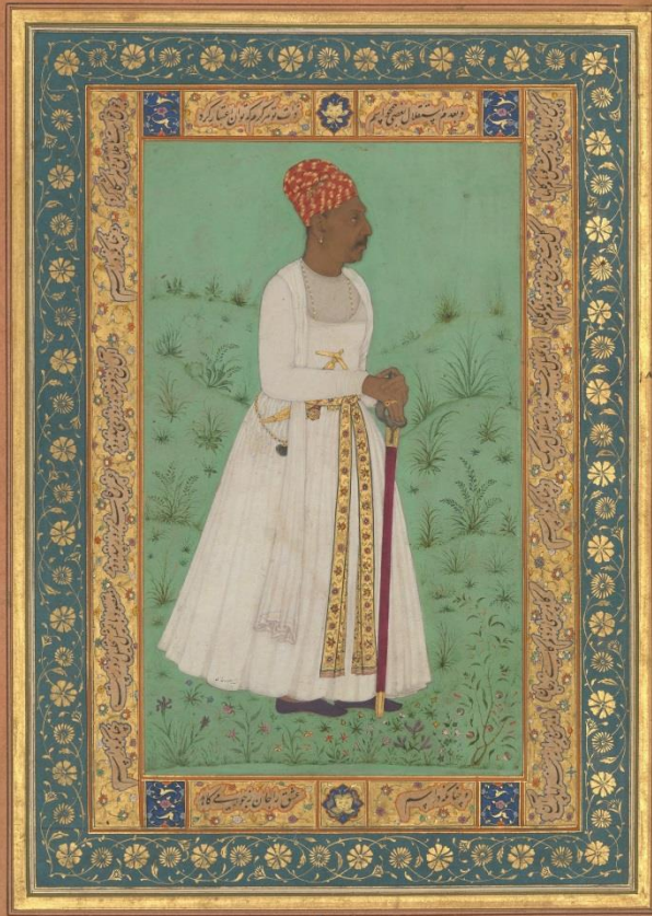
سجاددن رای دکنی علی با سم