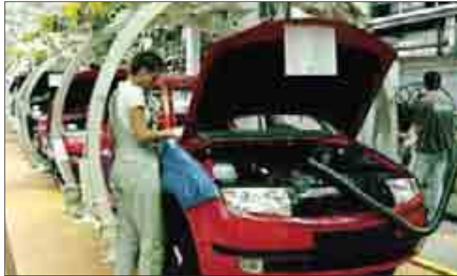
Car assembly line.

12. Assembling. Every machine or structure must be assembled as a unit before it can function. Large units must often be assembled in the shop, tested and then taken to be transported to their place of service. The final location of any machine is important and the design engineer must anticipate the exact location and the local facilities for erection.