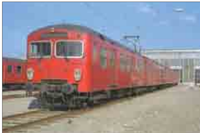
Design considerations play important role in the successful production of machines.

The standard or stock parts should be used whenever possible ; parts for which patterns are already in existence such as gears, pulleys and bearings and parts which may be selected from regular shop stock such as screws, nuts and pins. Bolts and studs should be as few as possible to avoid the delay caused by changing drills, reamers and taps and also to decrease the number of wrenches required.