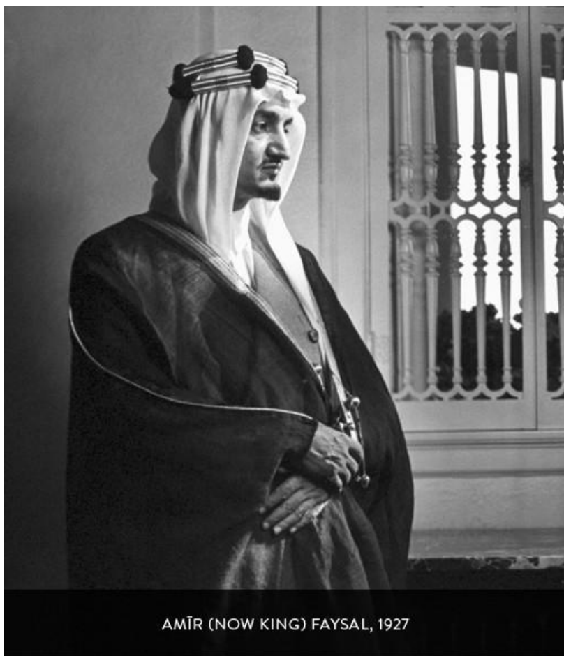
AMĪR (NOW KING) FAYSAL, 1927