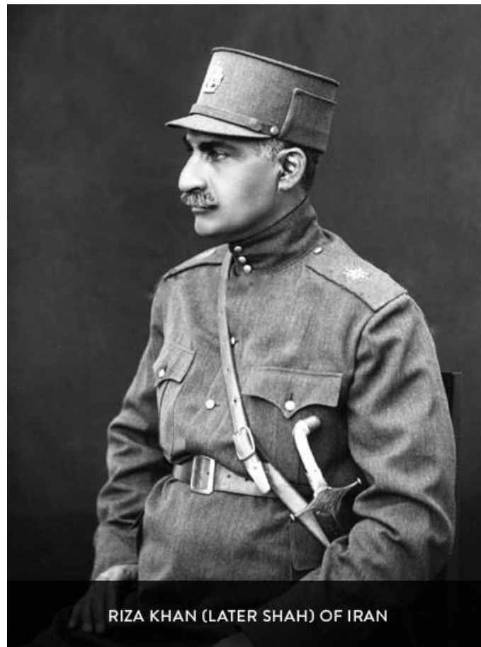
RIZA KHAN (LATER SHAH) OF IRAN