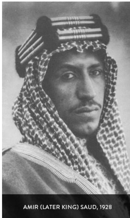
AMIR (LATER KING) SAUD, 1928

The natural environment of the beduin is hard and inclement. Steppes and deserts, sometimes traversed by dry river-beds which carry water only after infrequent rains; the scorching heat of summer days and the biting cold of winter nights; shallow desert wells here and there, yielding scant quantities of mostly brackish water; a vegetation so scarce for most of the year that it allows only for the breeding of camels and small cattle; and a tremendous expanse of skies, pale and burning in daytime like molten metal, and infinitely high and majestic, black and starry, by night: all this has contributed to the emergence of a special human type and of moral and social characteristics not to be found anywhere else.