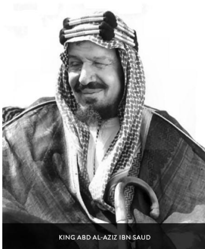
KING ABD AL-AZIZ IBN SAUD

The palm orchards of Al-Arish disappeared as suddenly as they had come. We were now travelling through shell-coloured light. Outside, behind the shaking windowpanes, a stillness such as I never had thought possible. All forms and movements were devoid of a yesterday and a tomorrow - they were simply there, in a heady uniqueness. Delicate sand, built up by the wind into soft hillocks that glowed pale orange under the sun, like very old parchment, only softer, less brittle in their breaks and curves, swinging in sharp, decisive violin strokes on the summits, infinitely tender in the flanks, with translucent water-colour shadows - purple and lilac and rusty pink - in the shallow dips and hollows. Opalescent clouds, cactus bushes here and there and sometimes long-stemmed, hard grasses. Once or twice I saw spare, barefooted beduins and a camel caravan loaded with palm fronds which they were carrying from somewhere to somewhere. I felt enwrapped by the great landscape.