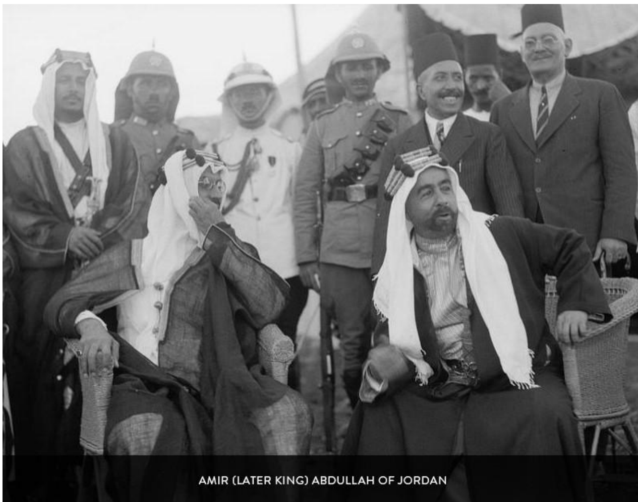
AMIR (LATER KING) ABDULLAH OF JORDAN

We supped together, men and women, sitting cross-legged on a mat around a huge dish filled with a porridge of coarsely crushed wheat and milk. My hosts tore small pieces from large, paper-thin loaves of bread with which they deftly scooped up the porridge without ever touching it with their fingers. To me they had given a spoon; but I refused it and attempted, not without success, and to the evident pleasure of my friends, to emulate their simple and nevertheless dainty manner of eating.