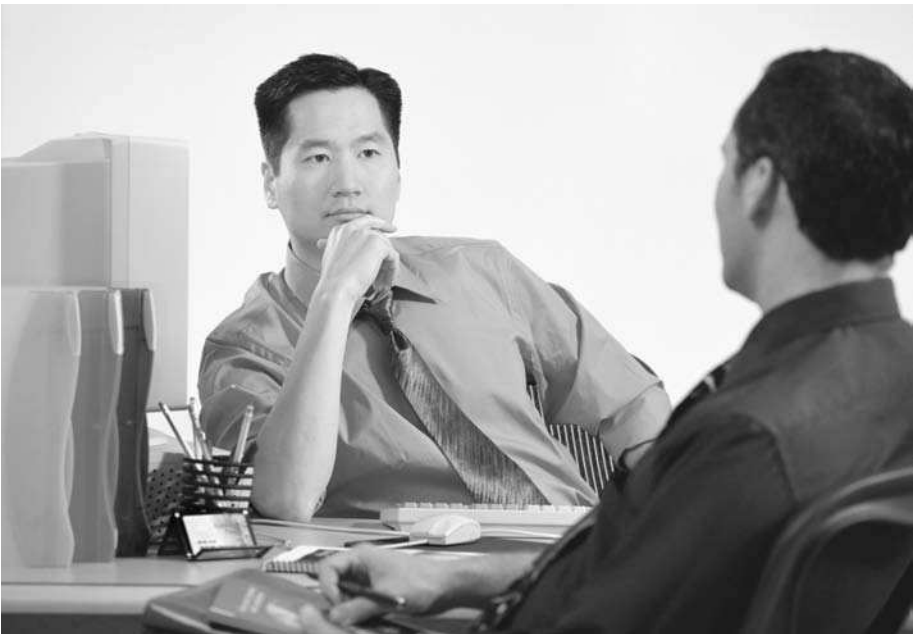
Being a good listener will expose you to new ideas and viewpoints—and help you do your job better.

To stay focused during a long presentation, it also helps to take notes. You don't have to worry about all the details; just listen for the main ideas and write them down. This will help you to concentrate and avoid becoming distracted. Some presentations are followed by question-and-answer sessions. It's often a good idea to formulate questions while you