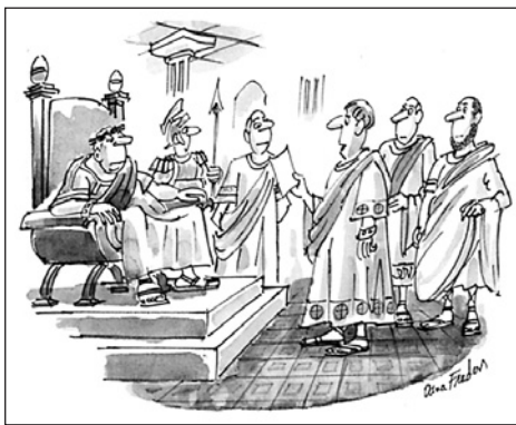
Drawing by Dana Fradon

firms for forecasting and policy analysis. As we discussed in Chapter 11, these large-scale computer models are made up of many equations, each representing a part of the economy. After making assumptions about the path of the exogenous variables, such as monetary policy, fiscal policy, and oil prices, these models yield predictions about unemployment, inflation, and other endogenous variables. Keep in mind, however, that the validity of these predictions is only as good as the model and the forecasters' assumptions about the exogenous variables.