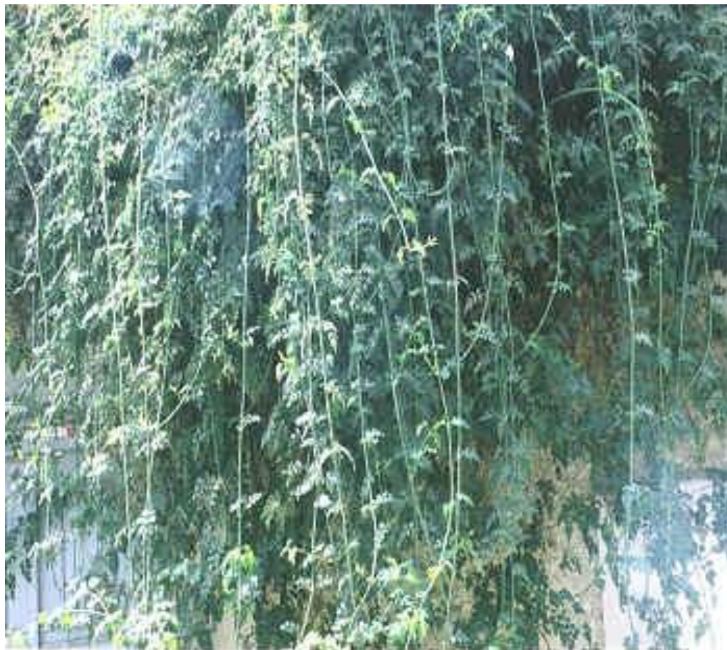
Jasminum grandiflorum Chambaili