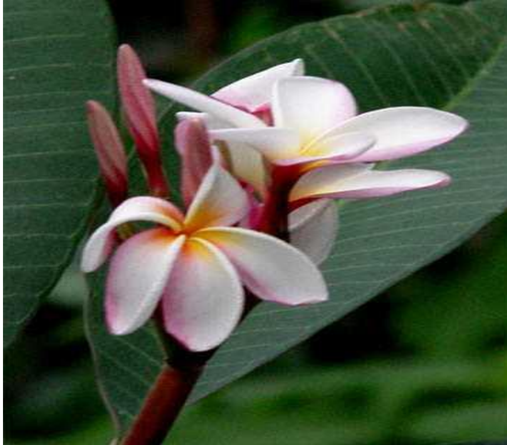
Plumeria obtuse Frangipani