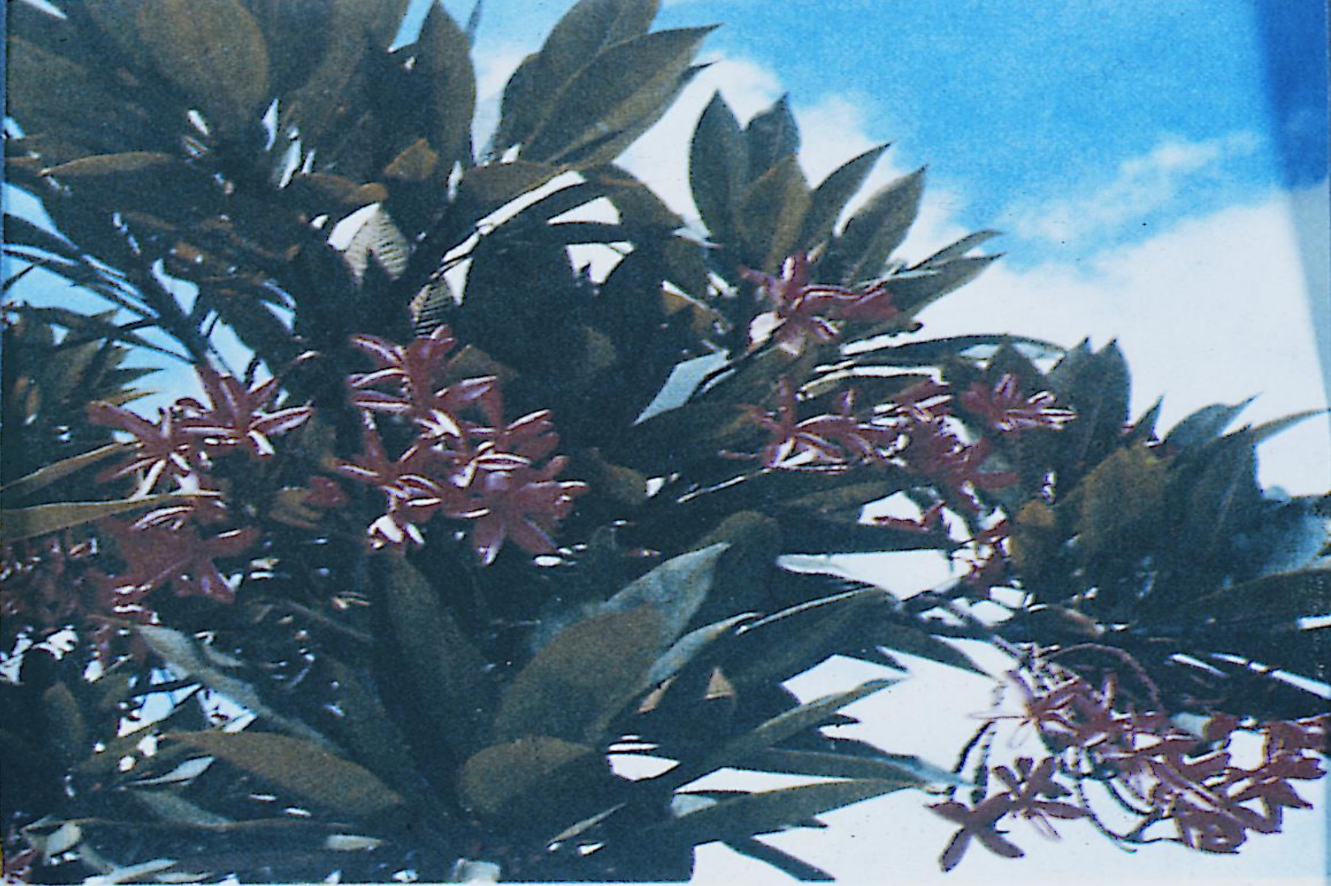
✓ Plumeria 'Rubra hybrid' Diamond Head, Hawaii