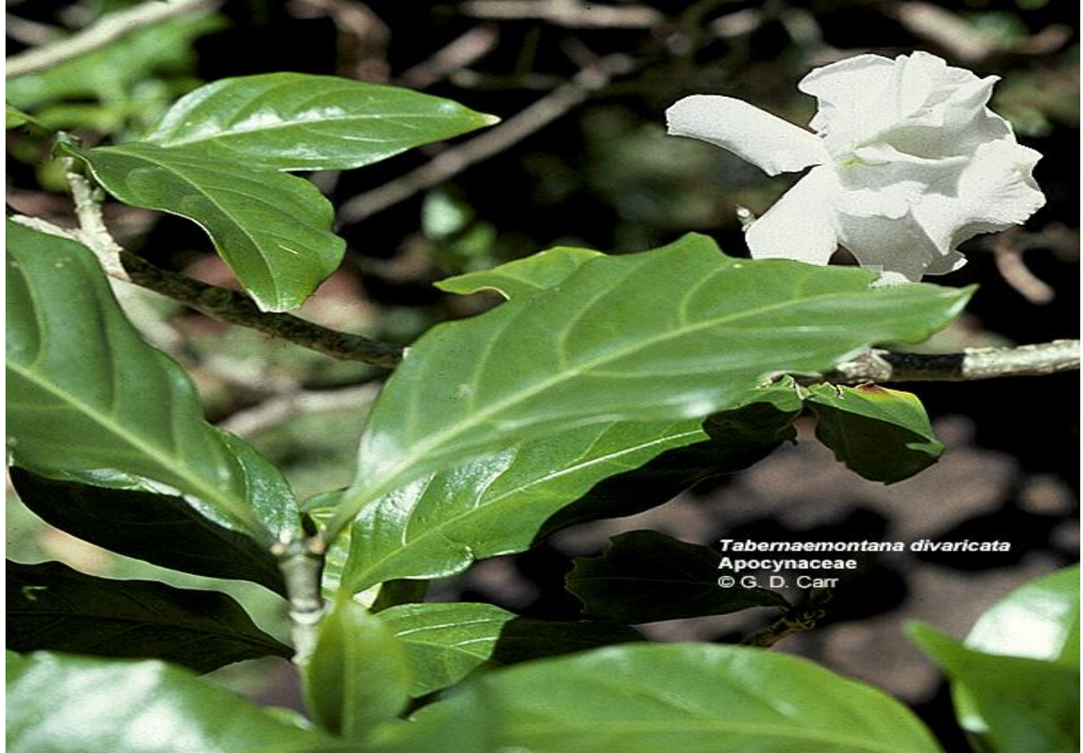
Tabernaemontana divaricata Crape jasmine