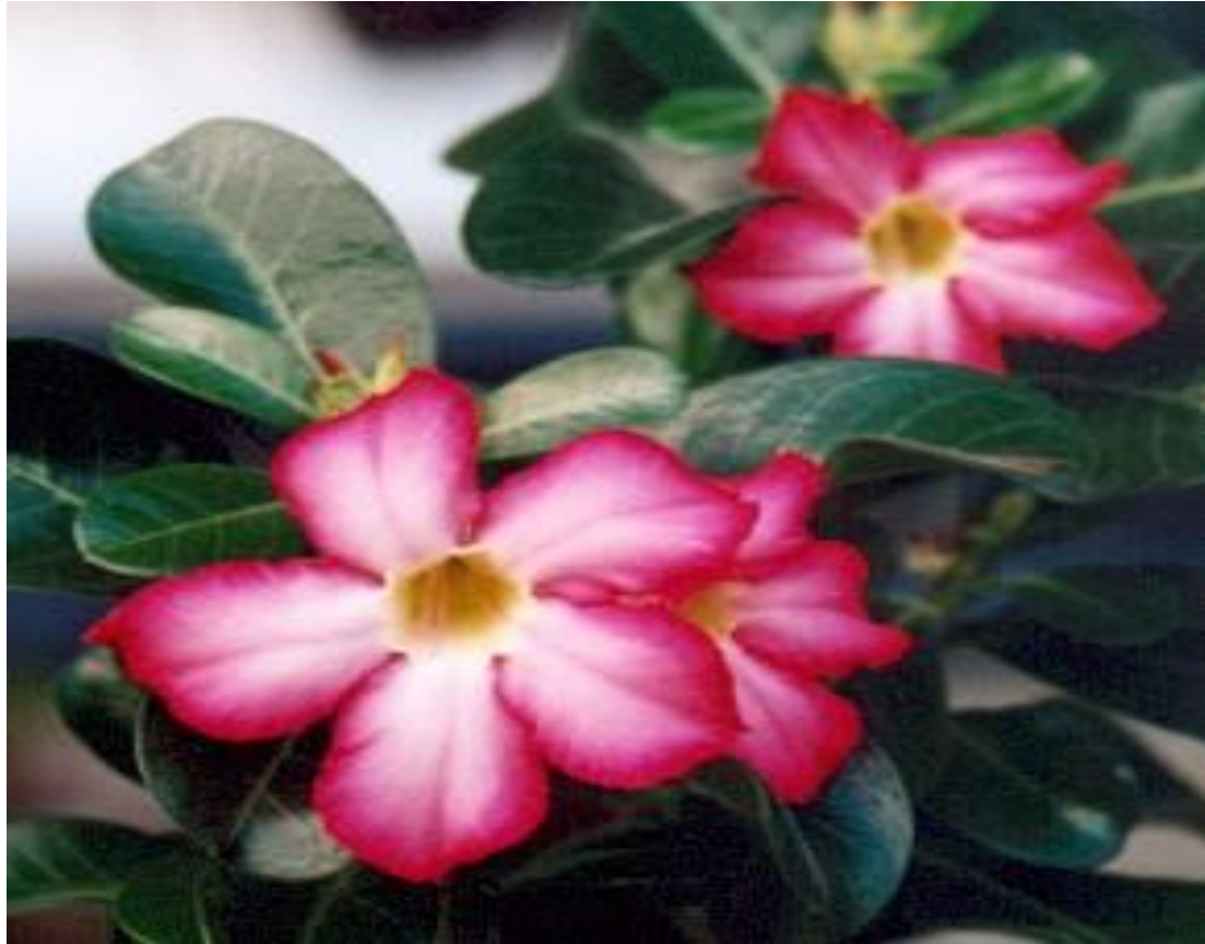
Adenium obesum Desert Rose