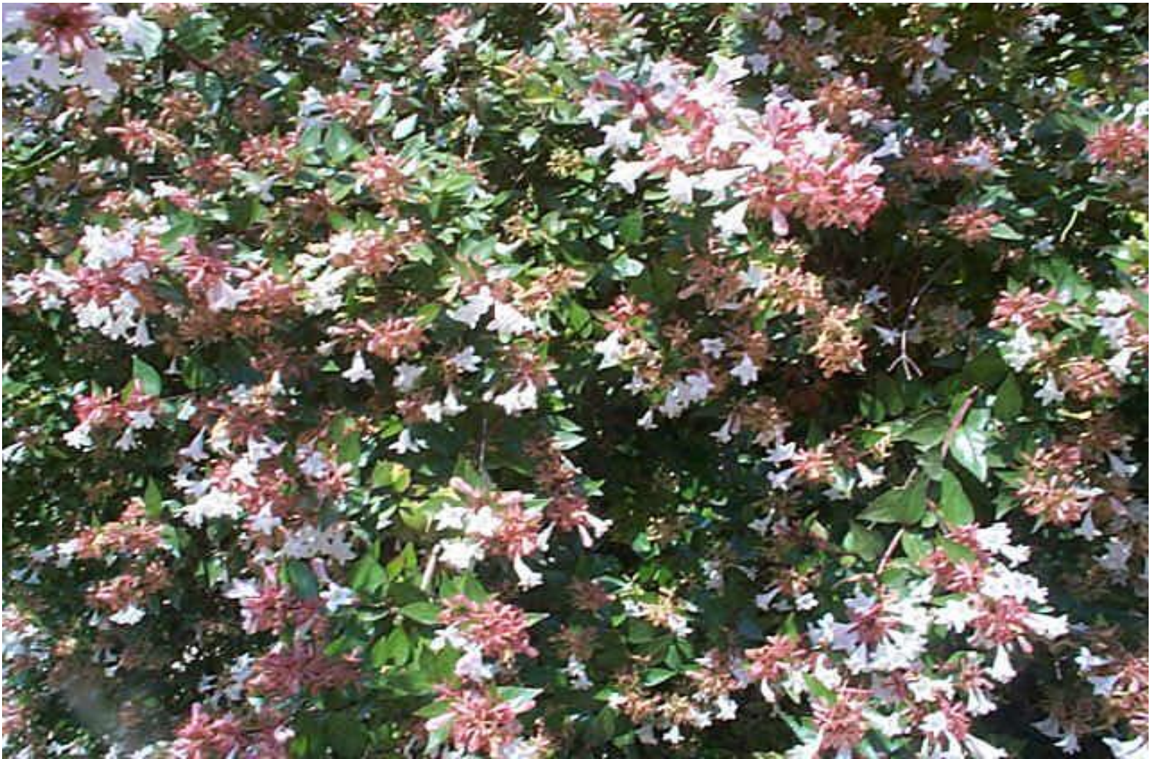
Lagerstromia indica Alba