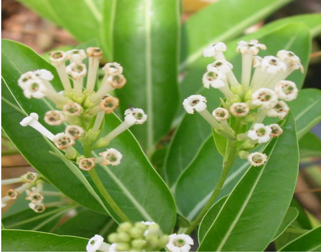
Cestrum diurnum King of the day