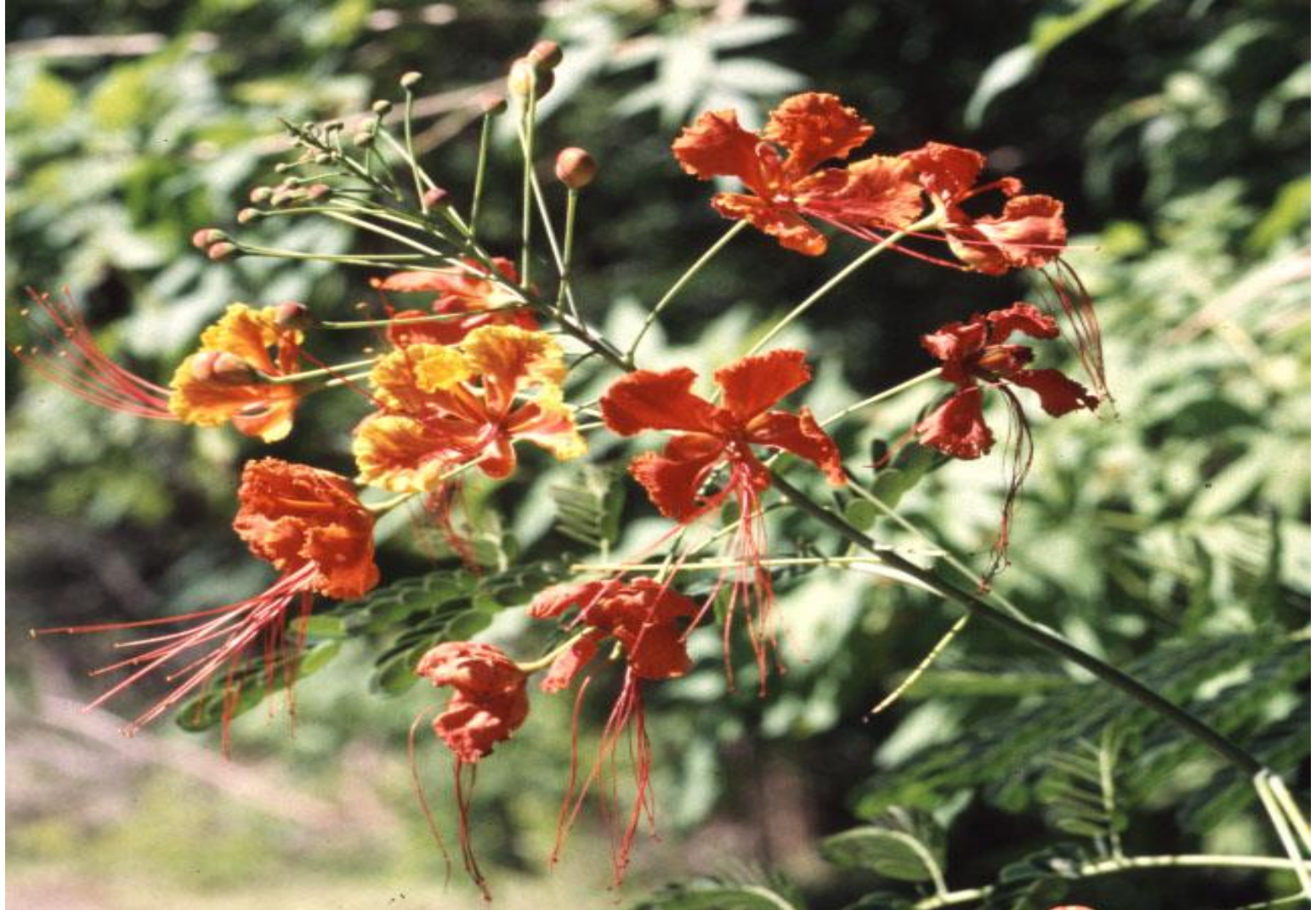
Poinciana pulcherrima small gold mohar