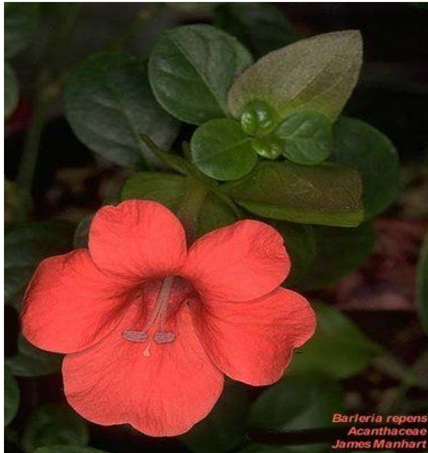
Barleria rosea Phillippine violtet