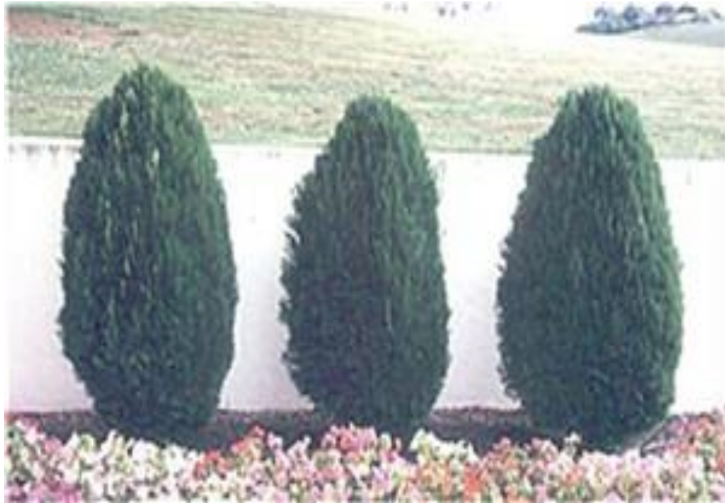
Thuja orientalis Morpankeh