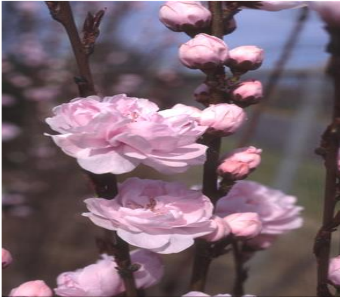
Prunus persica Ornamental peach