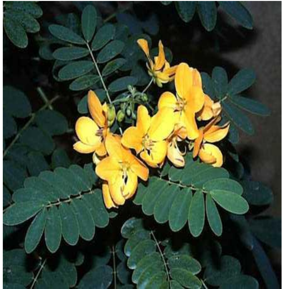
Cassia glauca Cassia