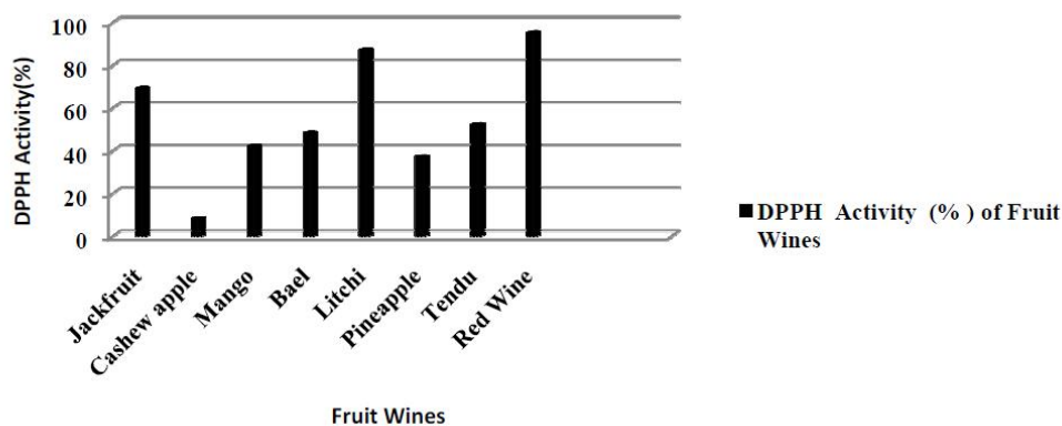
Figure 2 : Antioxidant activity of tropical fruits wine