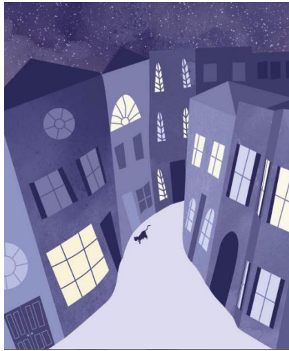
Quiet and Loud