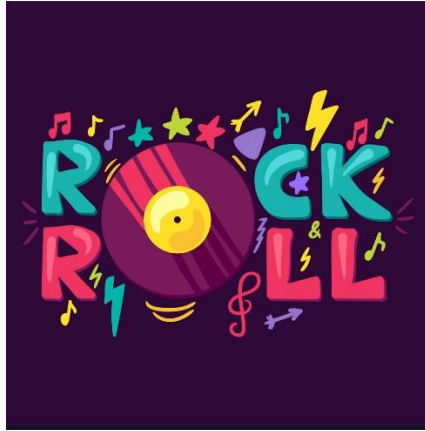
Rock and Roll