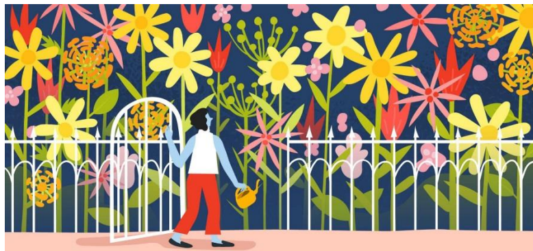
Rush and Lush