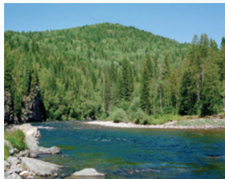
Forest of Central Siberia.