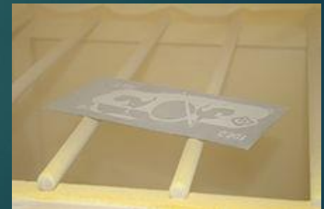
Zinc plate with powder resin.