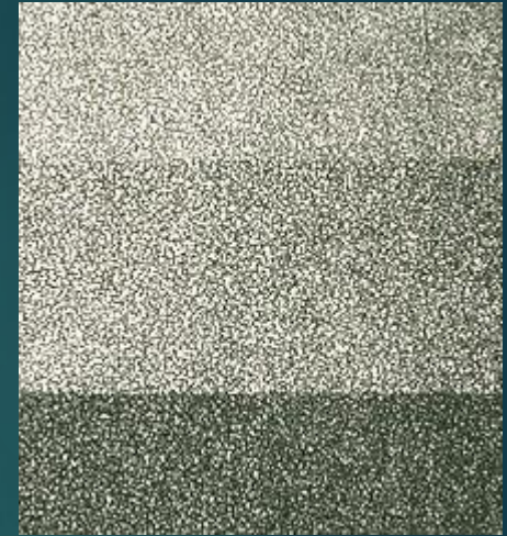
Demonstration sections of printed aquatint, magnified.