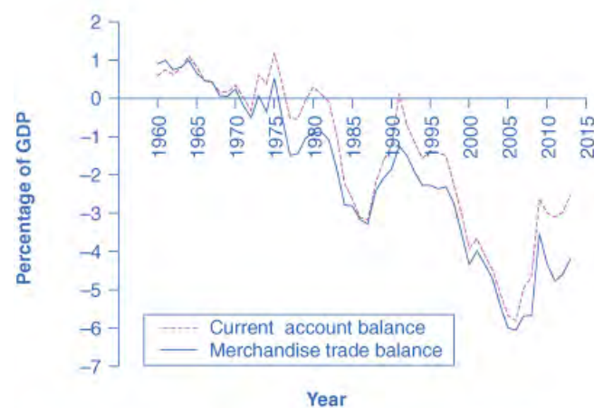
(b) The current account and merchandise trade balance as a percentage of GDP

Figure 23.2 Current Account Balance and Merchandise Trade Balance, 1960–2013 (a) The current account balance and the merchandise trade balance in billions of dollars from 1960 to 2013. If the lines are above zero dollars, the United States was running a positive trade balance and current account balance. If the lines fall below zero dollars, the United States is running a trade deficit and a deficit in its current account balance. (b) These same items—trade balance and current account balance—are shown in relationship to the size of the U.S. economy, or GDP, from 1960 to 2012.