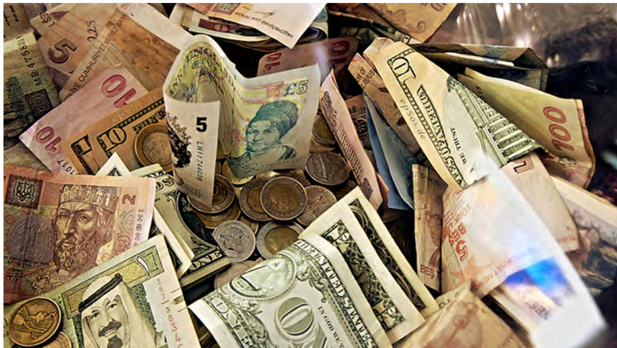
Figure 23.1 A World of Money We are all part of the global financial system, which includes many different currencies.