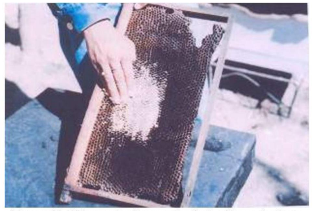
Figure 12.4 Frame feeding method of pollen substitute

Pollen substitute patty wrapped in butter paper and top bar feeding method