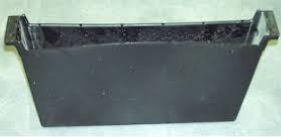
Division Board Feeder

For feeding sugar syrup inside the hive.