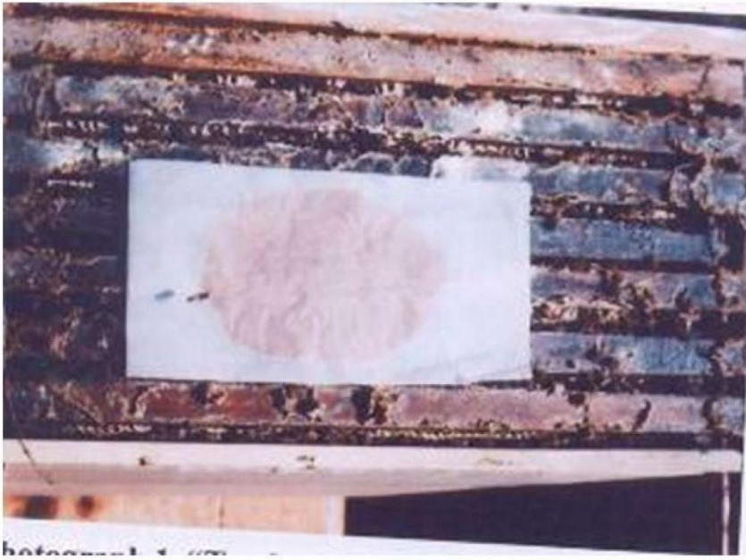
Pollen substitute patty wrapped in butter paper and top bar feeding method