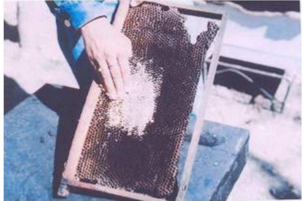
Figure 12.4 Frame feeding method of pollen substitute