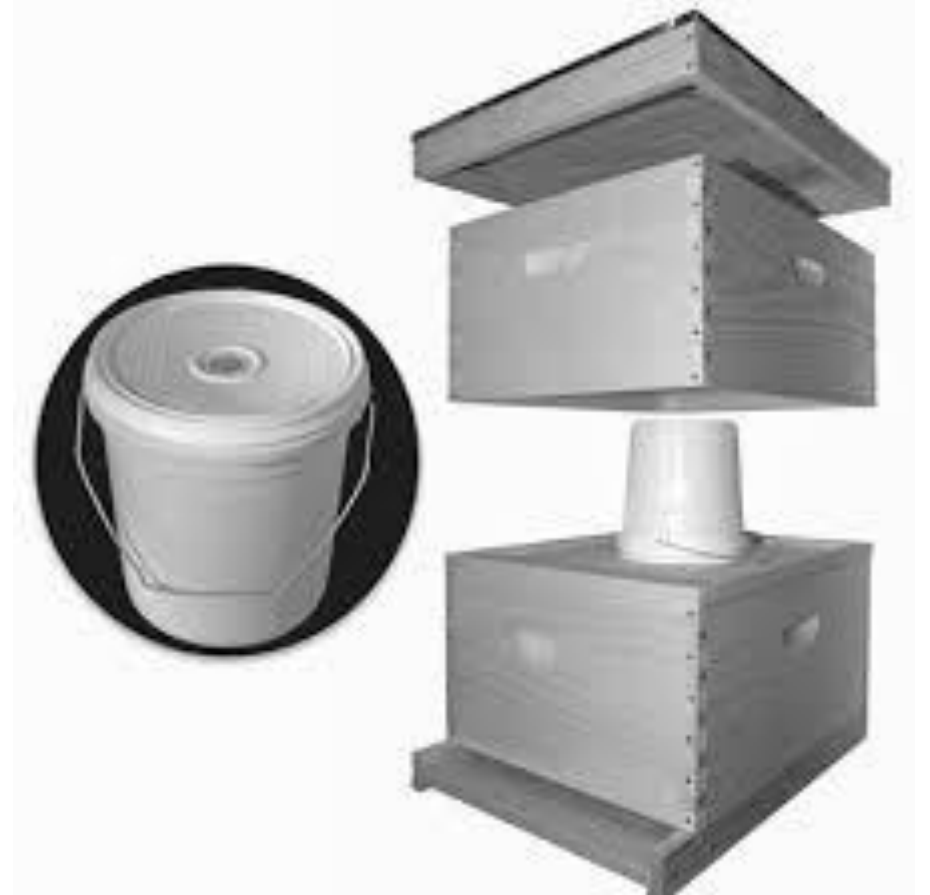
Friction pail feeder

For feeding sugar syrup inside the hive.