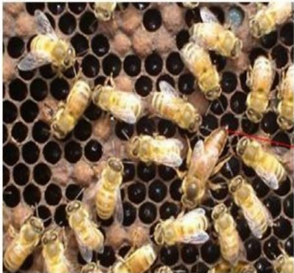
Figure 12.9: Failing queen and patchy brood pattern: Observe uncontrolled laying