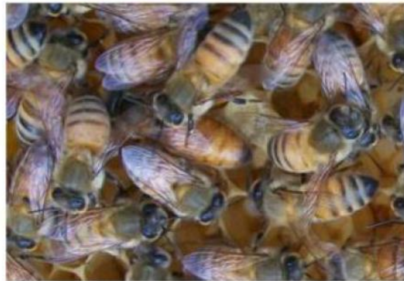
Fig. 12.7 Unmated queen