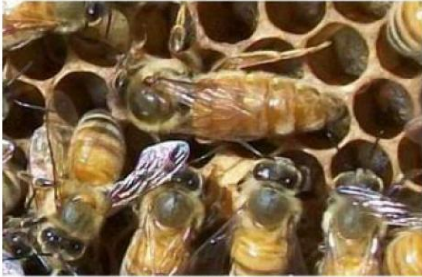
Fig. 12.5 Good queen