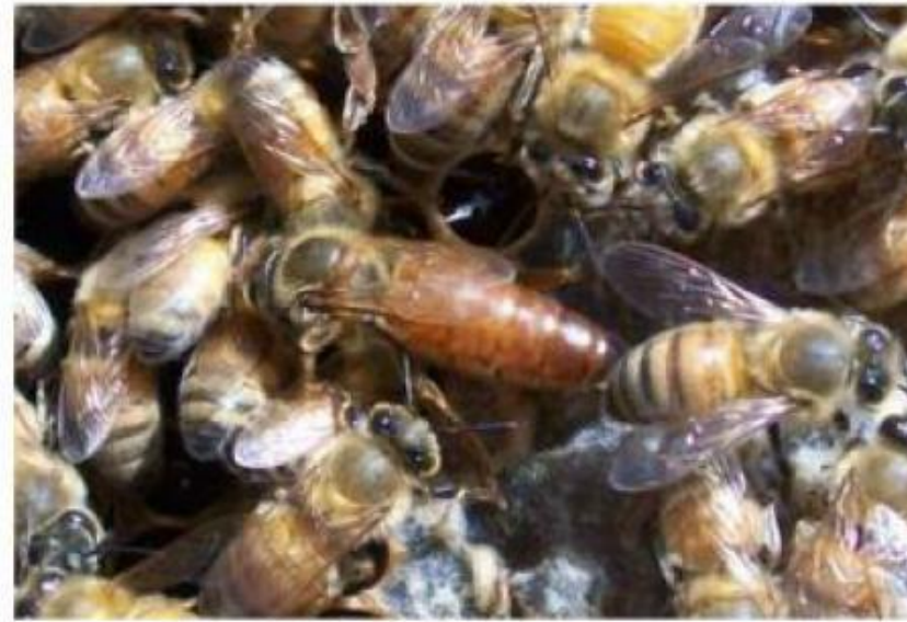
Fig. 12.6 Old failing queen