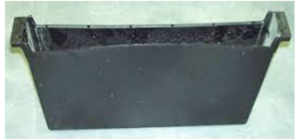
Division Board Feeder

For feeding sugar syrup inside the hive.