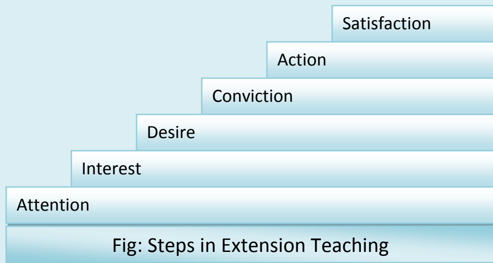
Fig: Steps in Extension Teaching

The first step in extension teaching is to make the people aware of the