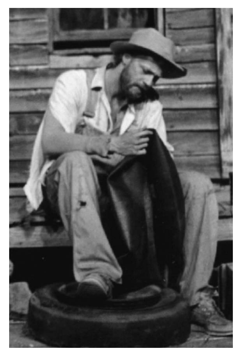
Plate 7. Tobacco Road , by Jack Kirkland (adapted from the book by Erskine Caldwell), directed by Blair E. Beasley, Jr., Winthrop University.

Incredibly popular in its initial run and tour, followed by a successful film version, Tobacco Road expresses the tensions of the decade. In its open display of seething sexuality, the play is shocking, while in its exaggeration of sex (as evidenced by the family comically trying to reach the window to peer in on Dude's conjugal sex) the play suggests a farce. However, the violence, cruelty, selfishness, and poverty forced upon its characters take the play into the realm of the socially conscious – the kind of play that can assuage its well-to-do audience of "survivor guilt" during the