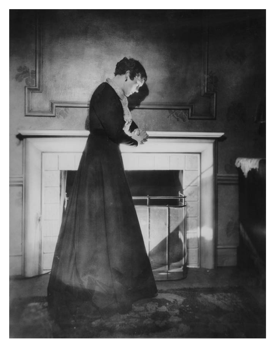
Plate 1. Eva Le Gallienne in Alison's House , by Susan Glaspell, original production, Civic Repertory Theatre, 1930.