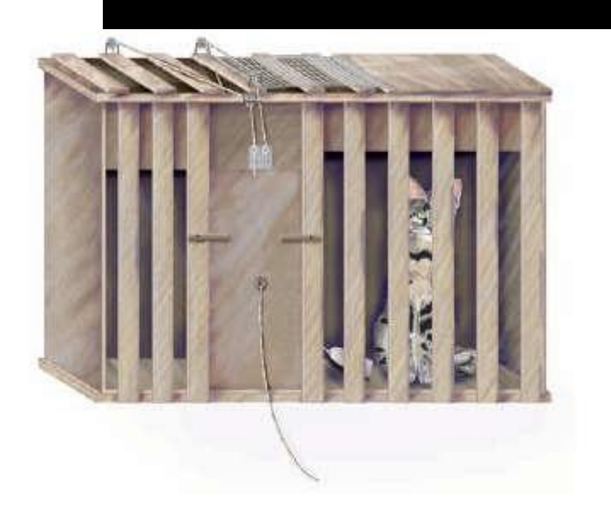
A typical Thorndike puzzle box. A typical Thorndike puzzle box. The cat is placed inside the box and can get out by pushing on the little platform to one side of the door—at first, accidentally. Each time the cat managed to escape, it would be put back into the box until, through trial and error, it knew to push on the platform to open the door.