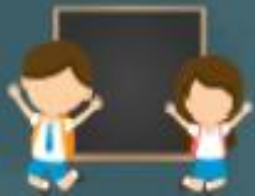
Child-created BULLETIN BOARDS

The mounted bulletin boards can be categorised into several types. These are: