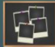
Interactive BULLETIN BOARDS