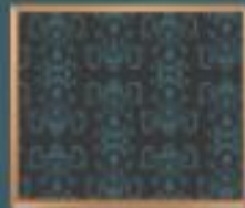
Decorative BULLETIN BOARDS