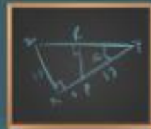
Conceptual BULLETIN BOARDS