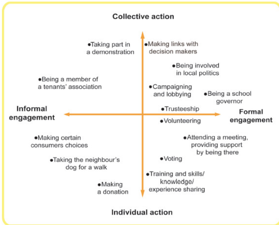
Figure 2: Four aspects of active citizenship