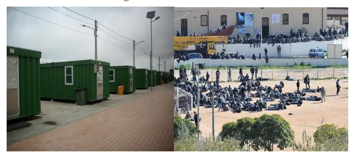
Figure 1 : the CARA of Crotone

should be distinguished (asylum seekers in CARA, migrants awaiting for deportation or identification CDA).