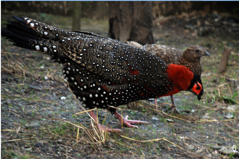
Figures 4-6. 4, Hog Deer © Waseem / WWF – Pakistan; 5, Marbled Teal Duck, © Rab Nawaz / WWF – Pakistan; 6, Western Horned Tragopan Pheasant.