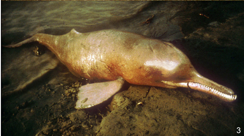
Figures 1-3. 1, Indian Rhino, (courtesy WWF – Pakistan, photographer Y.J. Rey Millet); 2, Black Buck, Antelope Cervicapra , (courtesy WWF – Pakistan); 3, Blind Indus dolphin, © EDRC / WWF – Pakistan.

Over 177 species of reptiles are known in Pakistan; Chelonia - 14, Crocodilia - 1, Sauria - 90, and Serpentes - 65. Of these, 13 species are believed to be endemic (Table 1). As with other groups, these are a blend of Palaeartic, Indo-Malayan and Ethiopian forms. One genus, the monospecific Teratolepsis , is endemic, while another, Eristicophis , is near-endemic. The Chagai Desert is of particular interest for reptiles, with six