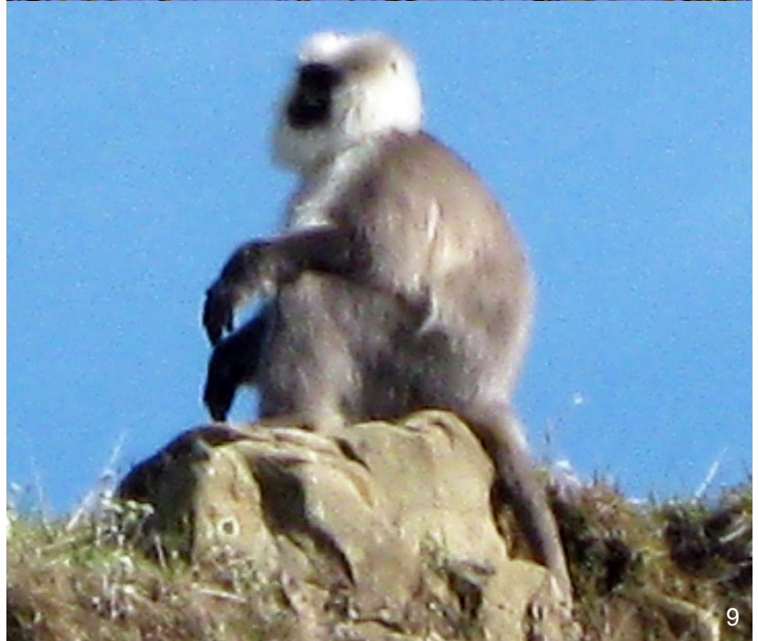
Figures 7-9. 7, Western Horned Tragopan Pheasant; 8, Spoon Bill, Platalea Leucorodia; 9, Hanuman Langur, Semnopithecus entellus .