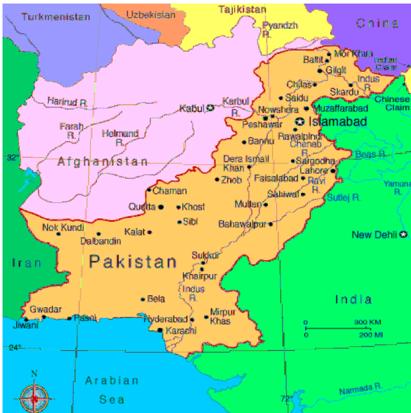
Map 1. Pakistan

The country has been divided into nine main agro-ecological zones. About 80% of the country is arid and semi-arid, along with 12% sub-humid and 8% humid, with two distinct seasons (i.e. summer and winter) (GOP 2001). The monsoons bring the major portion of annual rainfall to most of the country. There are also winter rains, which are limited in quantity. Because of its uneven distribution, precipitation is generally inadequate for productive rain-fed agriculture. There are vast areas of arid and semi-arid habitat which host important biodiversity resources in the country. In addition, the Arabian Sea region around the country is rich in phytoplankton and zooplankton (Parnetta 1993).