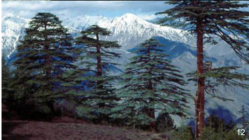
Figures 10-12. 10, Black-Winged Stilt, Himantopus Himantopus, 11, Snow Leopard, 12, Temperate forest.

the Ministry of Environment) oversees all policy coordination, research and education, as well as liaison matters related to forestry, rangelands, and wildlife management.