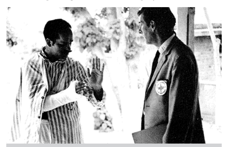
An ICRC delegate talks with an Indian prisoner of war, in a military hospital at Rawalpindi, Pakistan.

"Where the conduct of any person subject to this Act, when being taken prisoner by or whilst in the hands of the enemy, is to be inquired into under this Act or any other law for the time being in force, the Commander-in-Chief or any officer empowered by him in this behalf may order that the whole or any part of the pay and allowances of such person shall be withheld pending the result of such inquiry." 35