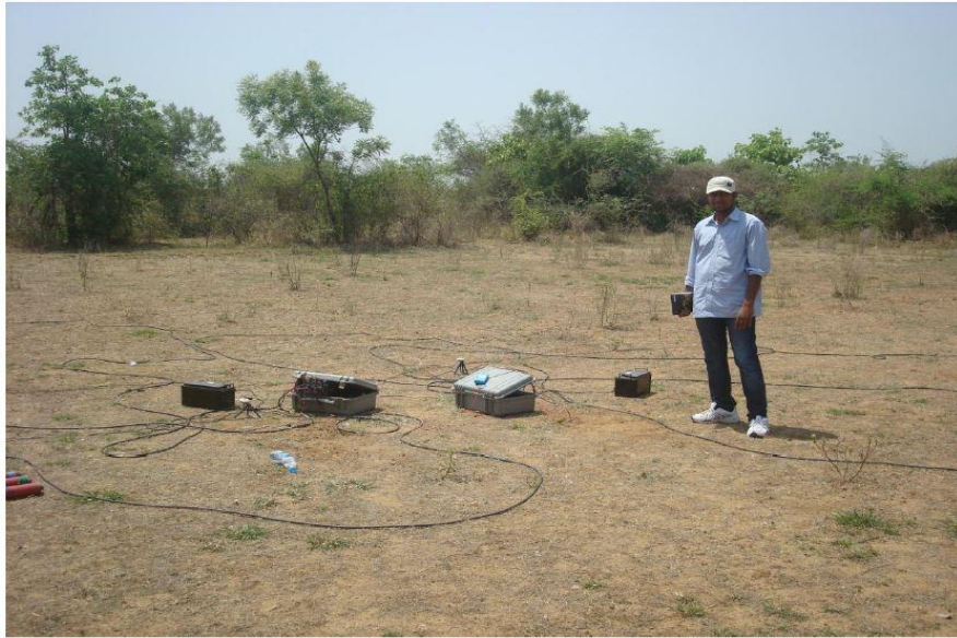
Fig. 7 MT Acquisition

Electrical Resistivity methods have been very successfully used in geothermal exploration to identify subsurface anomalies. Change in the electrical resistivity of the rock fluid volume is dependent on hydrothermal alteration and heat flow data (Moskowitz and Norton, 1977). Resistivity sounding and profiling are two most commonly applied procedures on the field for estimating underground resistivity. The objective of resistivity sounding is to estimate variation of resistivity values with depth below a given point. Such type of measurements are required when the ground consists of a number of more or less horizontal layers. The object of resistivity profiling is to detect the lateral variation of resistivity of the ground. This kind of survey is undertaken to delineate underground anomalies which has low resistivity values (Moskowitz and Norton, 1977).