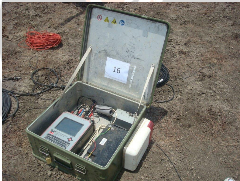
Fig. 6 MT Equipments

The MT method is very powerful geophysical tool to detect enhanced conductivity structure in the crust due to aqueous fluids, metallic minerals, interconnected graphite films and partial melt. Supplementary data like gravity, heat flow and seismic velocities are necessary in most cases to distinguish the source of the conductivity (Heise et al., 2006).