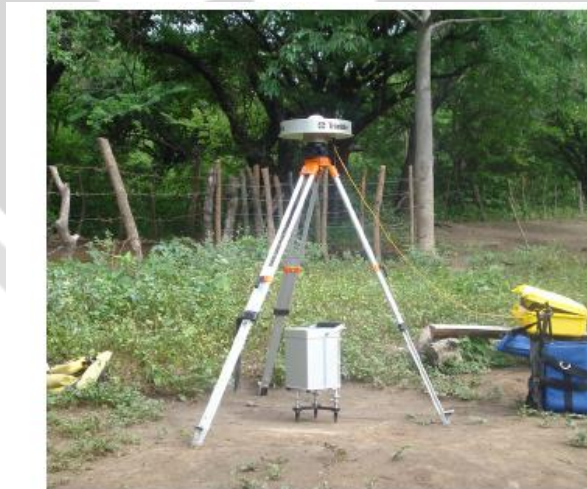
Fig. 5 Gravity Data Acquisition

The measured Bouguer gravity data (over a specified grid) gives the effect of gravity due to sediments and basements. The objective of the survey is to identify anomalies having density different other than that of the background. Once necessary corrections are applied to the data, the Bouguer gravity is separated to regional and residual. And the residual gravity interpretation gives the Geophysical anomalies (Sircar et al., 2015).