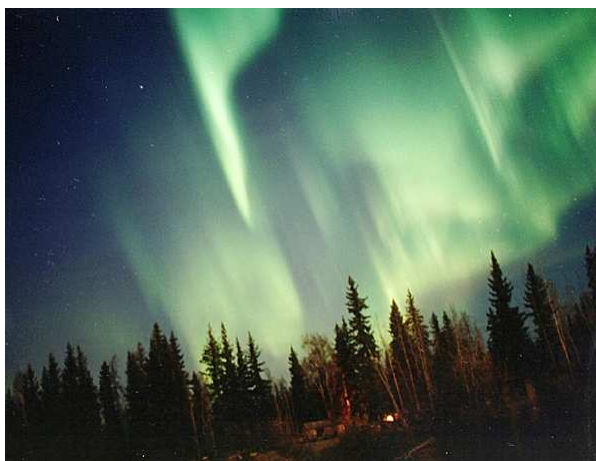
Figure 2.2: The aurora or northern lights (there is an equivalent southern display, hence aurora borealis and aurora australis). Particularly spectacular displays occur when sunspot activity is high.

We will begin a more technical description of plasmas in the next part, but it may first be a good idea to have a quick preliminary look at plasmas in nature. Everyone is familiar with plasmas! One of the most spectacular examples is lightning. This awesome discharge involves megavolts and megawatts of electricity, so it is not very easy to reproduce, but the tiny sparks produced by small batteries (when the terminals are briefly connected together) are basically the same phenomenon on a microscopic scale.